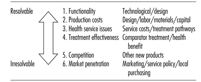
Table 2. Uncertainties in the Development Cycle

optimistic estimates in an early-stage deterministic headroom analysis (8). It is important to emphasize that optimistic estimates are a substitute for the probabilistic approaches considered here, which should be based on the best estimates available.