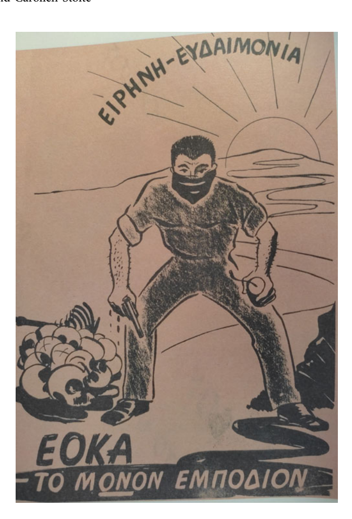
Figure 2. British propaganda leaflet: 'EOKA. The only obstacle.'<sup>82</sup>

anti-communist organisation 'X'.<sup>83</sup> Nevertheless, the global Cold War, in the Westadian sense of the term, provided the vocabulary to continue colonial interventions in a different dialogue.<sup>84</sup> Drawing from the visual repertoire of the era helped to confer legitimacy onto the state of emergency on the island.