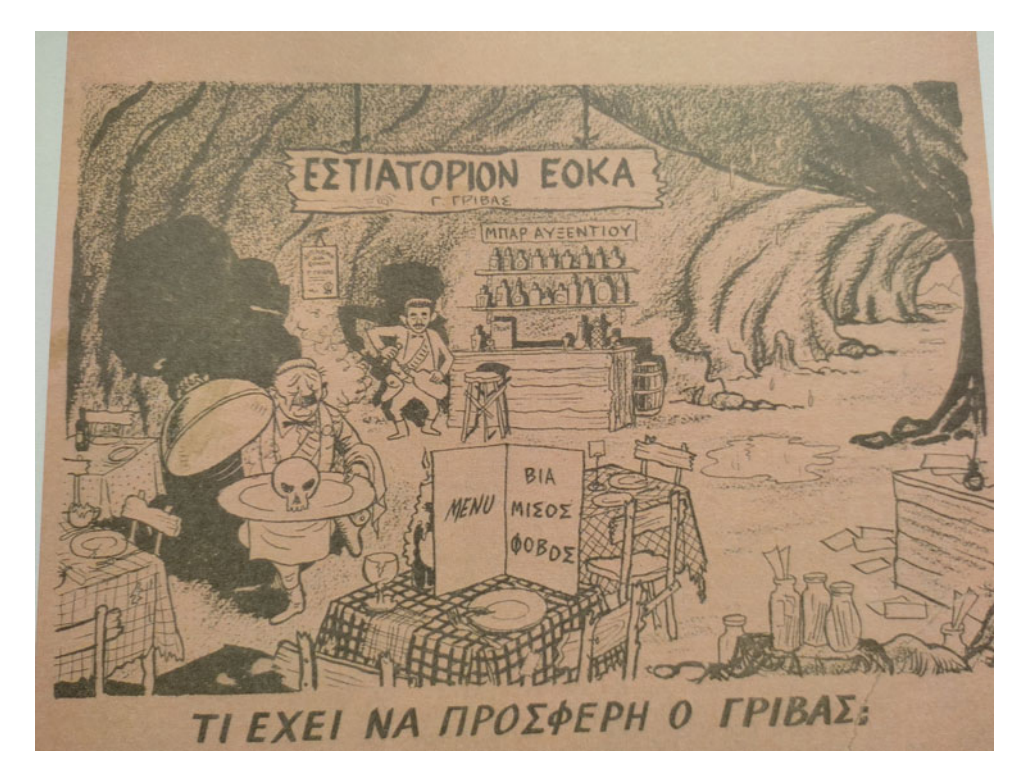
Figure 1. British propaganda leaflet: 'What does Grivas have to offer?'81

EOKA fighter, however, must also be analysed within the framework of the Cold War. The decolonisation wars of the 1950s cannot be seen as separate from wider Cold War notions and anxieties, particularly with regard to communist threats.