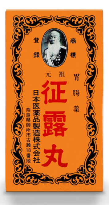
Figure 2: Ganso Seirogan. Current packaging.