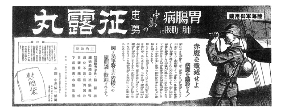
Figure 5: Osaka Asahi Shinbun, July 20, 1939.