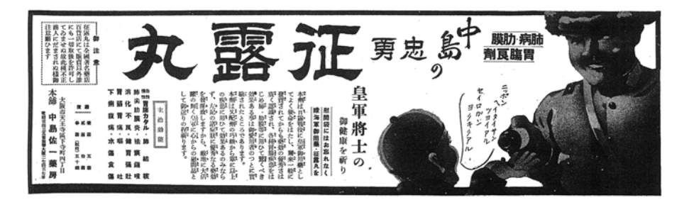
Figure 6: Osaka Asahi Shinbun, 17 February 1937.

(1600–1868), perceptions of Russia in Japan were anything but positive; whereas the Dutch and other Europeans were perceived in light of their religious and intellectual challenges, Russians, due to their geographical proximity to Japan, were predominantly portrayed as menacing intruders.<sup>52</sup> This negative image of Russia was further amplified and reinforced during the course of the Russo-Japanese War. In the process of creating and propagating a favourable image of Japan both within and without the Japanese archipelago, the Japanese authorities, often with the explicit support of American and British press, successfully demonised their enemy.<sup>53</sup> The subsequent Sovietisation of Russia further denigrated the image of Russia among the Japanese. And the Nakajima Drugstore did not hesitate to co-opt the widely recognised image of the Soviet demon. As is seen in the advertisement posted in Osaka Asahi Shinbun on 20 July 1939, communism personified by the Soviet Union was a 'red demon' (aka-ma in Japanese) that Japan was 'heavenly mandated' to destroy (Figure 5). Rhyming with the call for action against communism was the exhortation to destroy the 'disease demon' (byo-ma) by using a drug, Seirogan. The comparison cannot be misunderstood – just as imperial Japan was destined to destroy the 'red demon', Seirogan was invented to kill the 'disease demon'.