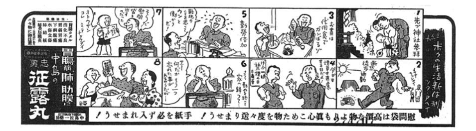
Figure 7: Osaka Asahi Shinbun, 2 November 1940.

commercial exhortations? Unfortunately, there are no official sales figures available from the 1930s and the first half of the 1940s, but we can ascertain the enduring success of the drug from circumstantial evidence.