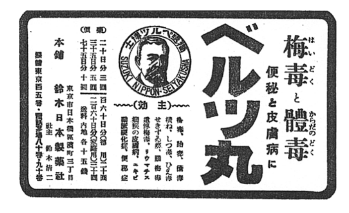
Figure 4: Osaka Asahi Shinbun, 8 April 1938.

cured such diverse diseases and symptoms as syphilis, intoxication, constipation, and general fatigue.