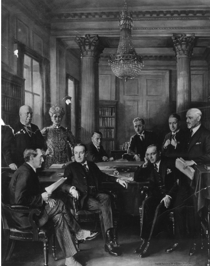
Illustration 1.1 The Imperial Conference, 1923.