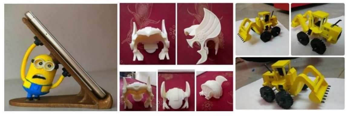
Figure 8. First-semester project work of students at IIT Hyderabad

In response to the challenges mentioned above, many organisations like Digital fabrication laboratories (FabLabs), Maker's Asylum, TinkerLabs, are working hard to integrate technology, design and craft. Similarly, an online portal like Jaaga (https://jaaga.in/blorecreate/) provides a faster and cheaper way to connect, collaborate and create. These workshops and websites are providing artisans with a platform to practice and realise their unique crafts. More and more Indian institutes and design colleges offer 3D modelling and printing knowledge through workshops and courses. Thus, based on our research, we can postulate that Digital Artisans will act as a catalyst for Indian culture and traditional crafts and emerging technologies like adaptive manufacturing. They will help to bring the best out of these two strikingly vibrant and different mediums of creativity.