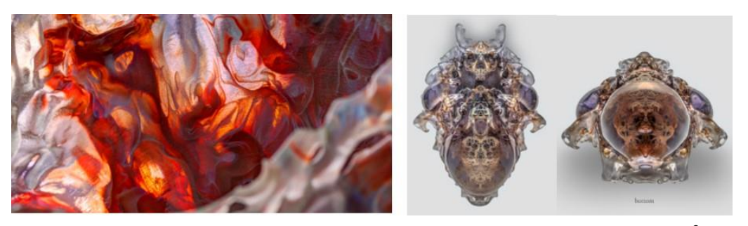
Figure 4. Deathmask with internal colour strand and transparent curve volume<sup>2</sup>

"Vespers" is a series of death masks designed by Neri Oxman and her team (Figure 4). It comprises of three groups, with five masks each. Traditionally, these were made up of plaster of Paris modelled on the facial features of the deceased. Instead of commemorating the dead, these masks are conceptualised to focus on cultural beliefs, recreating them through modern technologies like modelling with high-resolution and multi-material 3D printing and artificial biology. Her concepts are highly futuristic and challenge the capabilities of 3D printing technology.