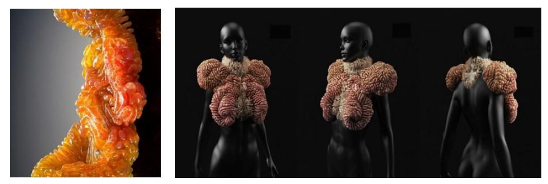
Figure 5. Qamar. Luna's Wanderer by Neri Oxman. 2014<sup>3</sup>

In her exploration, named 'Qamar', the Arabic terminology for the Goddess Luna is a breathing apparatus, as shown in Figure 5. It is inspired by the Lunar surface, and it is designed to carry oxygen and algae as a biofuel.