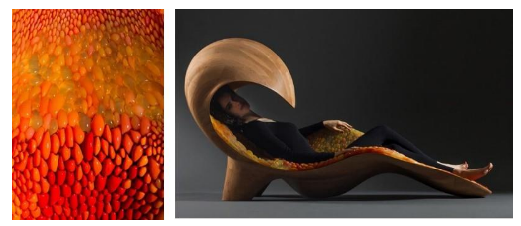
Figure 3. Gemini, by Neri Oxman, 2014<sup>1</sup>

"Vespers" is a series of death masks designed by Neri Oxman and her team (Figure 4). It comprises of three groups, with five masks each. Traditionally, these were made up of plaster of Paris modelled on the facial features of the deceased. Instead of commemorating the dead, these masks are conceptualised to focus on cultural beliefs, recreating them through modern technologies like modelling with high-resolution and multi-material 3D printing and artificial biology. Her concepts are highly futuristic and challenge the capabilities of 3D printing technology.