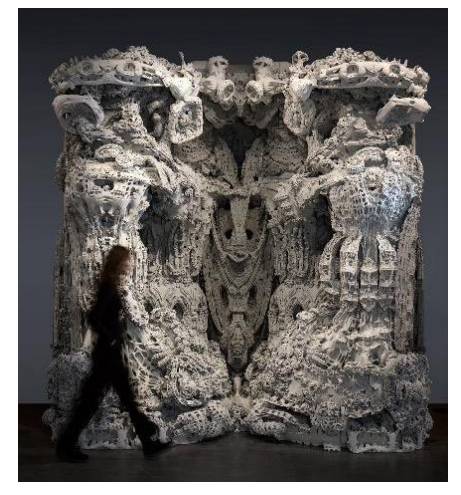
Figure 6. Grotto installed at Centre Pompidou<sup>4</sup>

An Architect and programmer by profession used computation to create architectural forms and spaces. His designs concepts are based on the usage of advanced technology, fabrication procedures, and additive manufacturing such as 3D printing. Thus, the form's complexity is no more a hindrance and incorporates function without disregarding form or, as Mr Meyer refers to as 'Visual Reductionism'. This has led to new possibilities instead of following the established norm of "Form follows Function". Armed with these tools, he uses his ideas to create forms and spaces which are highly sculptural. His creations delve into unique 'topographies and perspectives' that were otherwise very difficult to achieve through conventional architectural construction methods (Bushwinkel 2020).