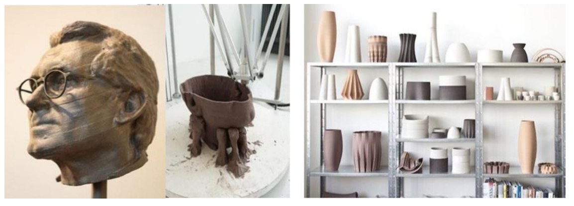
Figure 7. Nobel Prize Portrait Bronze head of Ben Feringa and different artefacts<sup>5</sup>

In one of his projects, he wanted to create a 3D portrait of the Nobel Prize winner Ben Feringa in clay for casting in bronze, as shown in Figure 7. The sculpting process required him to stop the machine again and again and detail out the different parts of the face, such as nostrils, ear lobes, etc., by hand. This art piece demonstrated the application and amalgamation of the machine and handmade processes. It was nowhere close to the precise outputs of industrial methods. He believes this new process of additive manufacturing has 'democratised the manufacturing processes and paved the way for the designer to be closer to the user in terms of their needs. It removes the industrial chain inbetween them a hindrance due to its limitations (Herpt 2012).