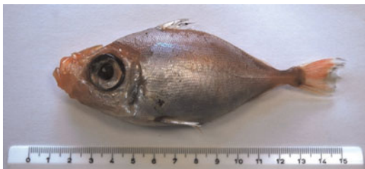
Fig. 2. One of the five specimens of Zenion hololepis (134 mm total length and 51.49 g) caught in Portuguese continental waters (north-eastern Atlantic).

There are no records in the literature of the occurrence of Z. hololepis in the north-eastern Atlantic Ocean, nor in the IPIMAR’s fisheries surveys database, which spans several decades of regular research campaigns along Portuguese waters.