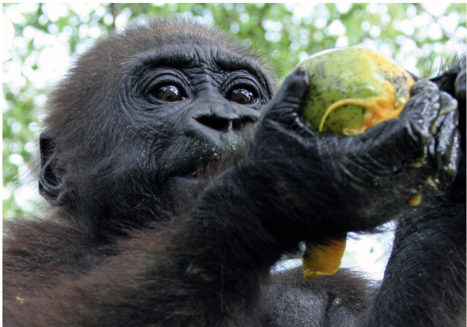
Photo: Apes held as pets by private owners are generally at greater risk of contracting and transmitting infectious diseases, as they live in closer proximity to humans. Illegally kept apes often suffer from various degrees of malnutrition and malabsorption. Juvenile gorilla at a hotel in Gabon. He was later sent to a sanctuary. © Alison White

Long-term visitors include researchers, documentary film crews, rangers and park personnel, local community members, carers and volunteers for captive and semi-captive