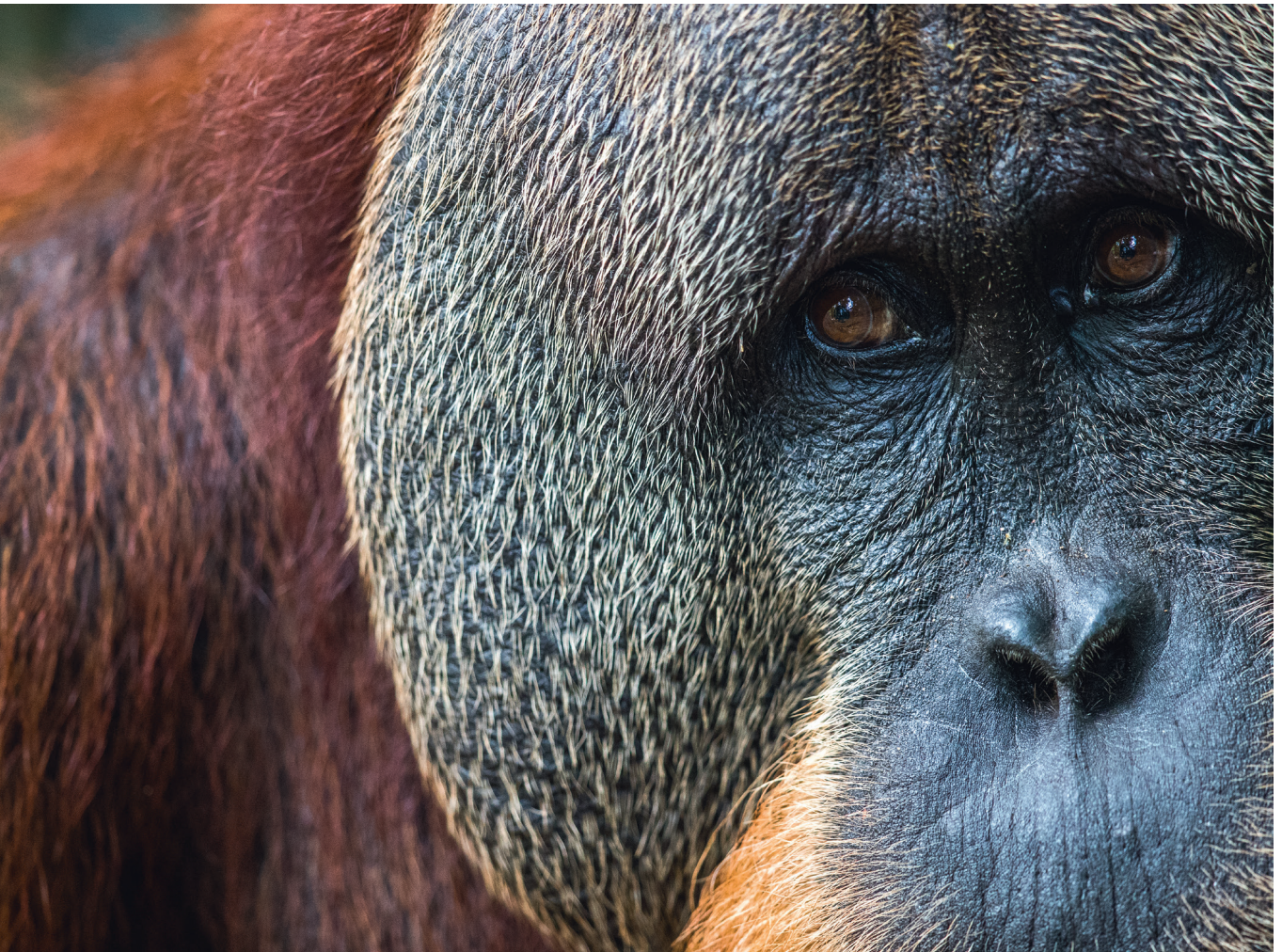
Photo: Apes—humans' closest living relatives—are intelligent, sentient beings with complex social lives. As such, they attract local and international scientists, students, tourists, filmmakers and other visitors in the wild and in captivity.

captive (and semi-captive) apes. The aim of a habituation process is to decrease the flight distance of apes when they encounter humans. The removal of apes' fear and need to flee effectively reduces any significant anthropogenic effect on their natural behavior, although some degree of human influence on their behavior is inevitable (Tutin and Fernandez, 1991; Williamson and Feistner, 2011). Moreover, habituation directly heightens the risks of disease spillover to apes, as they tolerate closer proximity to people (Köster et al. , 2022; Russon and Wallis, 2014a). One way of minimizing these risks is to ensure that habituation and