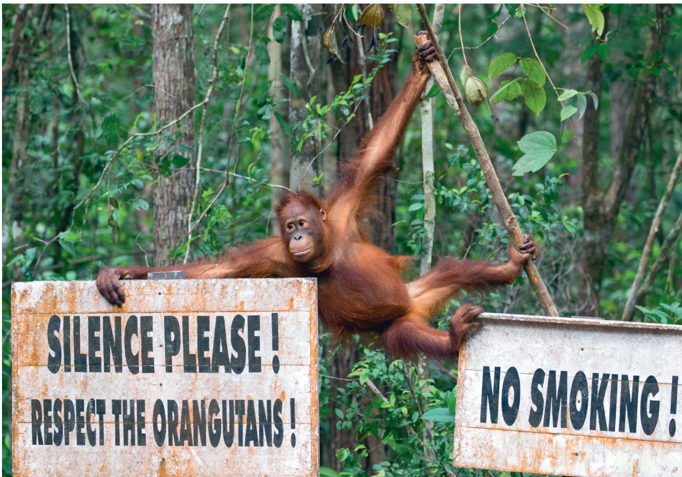
Photo: In rehabilitation sites such as Indonesia's Tanjung Puting in Kalimantan and Malaysian Borneo's Sepilok in Sabah, former rehabilitants not only stopped their usual foraging activities during tourist visitation and food provisioning, but also increased their vigilance and self-directed behaviors. Tanjung Puting National Park, Borneo, Indonesia.

susceptibility to diseases (Sapolsky et al. , 1990; Shutt et al. , 2014; Wasser, Sewall and Soules, 1993; Woodford, Butynski and Karesh, 2002). Studies undertaken during ape habituation processes have documented clinical signs of infectious diseases in chimpanzees, as well as higher parasitic loads in mountain gorillas, although the latter could be related to them living in close proximity to humans, near the park boundary (Fujita, 2011; Morton et al. , 2013). In contrast, analysis of fecal and hair cortisol concentrations shows that wild chimpanzees habituated to ecotourism are not chronically stressed, unlike orangutans and western lowland gorillas (Carlitz et al. , 2016; Muehlenbein et al. , 2012; Shutt et al. , 2014).