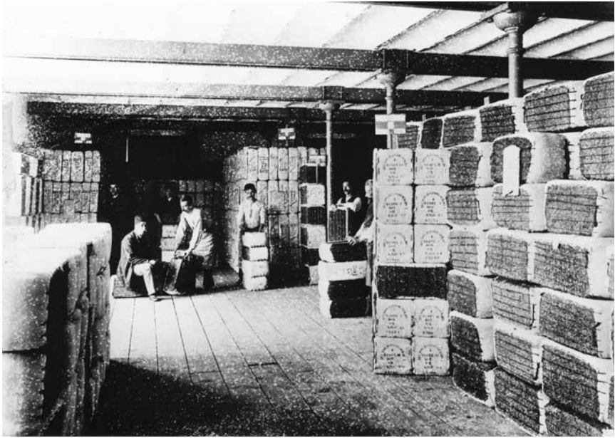
Figure 2. The depot of the Cibali Régie Factory, with workers and their superintendents carrying, counting, and stacking the large tobacco bales and the processed tobacco and cigarette packages. Photograph: Guillaume Berggren. Collection Kadir Has Museum. Used with permission.

mixes ( harman ) prepared by the tütüncü determined the quality, taste, aroma, and proper burning of the cigarette. 38