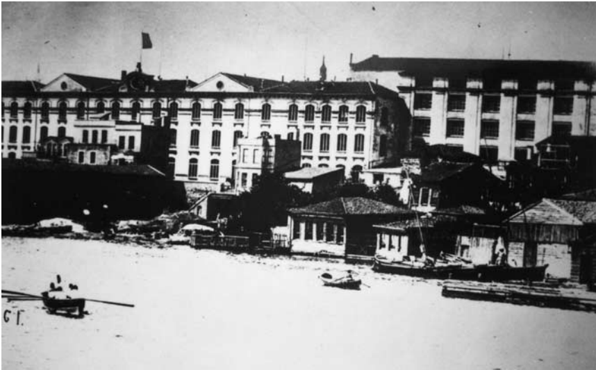
Figure 1. The Cibali Régie Factory was one of the largest tobacco processing and cigarette manufacturing factories in the Ottoman Empire.