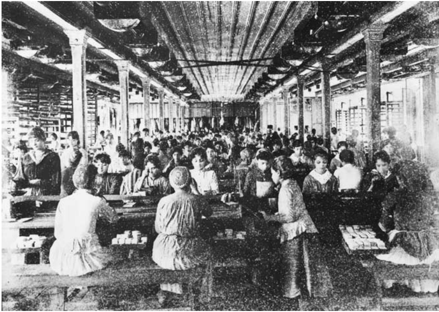
Figure 5. Large hall with young female workers rolling cigarettes.

spacious; however, though the image is of poor quality, it seems a little dim. Berggren offers a similar image in another photograph too (Figure 6, overleaf). Here we see a smaller but still largish workshop, where young female workers are seated in rows of desks. There are windows on both sides of the hall, but they are relatively small. There are three male superintendents watching the workers. There is also one female worker who is standing at the third row. She seems much older than the other workers, and might too be a superintendent.