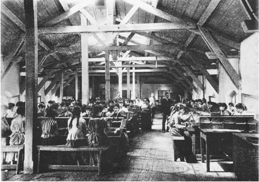
Figure 6. A smaller but still largish workshop, where young female workers are seated in rows of desks.