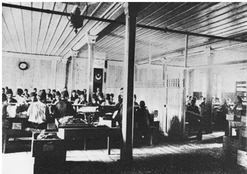
Figure 7. Although workers probably could not see the other department and interact with colleagues of the opposite sex, the wooden panels suggest that the walls between the departments were not impenetrable, but porous.