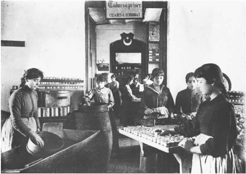
Figure 4. Female workers employed in the tobacco-packing department of the Cibali Régie Factory.