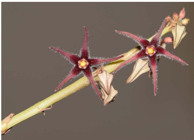
Flowers of Brachystelma attenuatum Hook. f.

This species was described by Robert Wight under the genus Eriopetalum Wight in 1835 on the basis of J.F. Royle's collection from Doongie (Dungi, Hamirpur, Himachal Pradesh). The two localities where we recollected the species are 4–10 km from this type locality. Along with