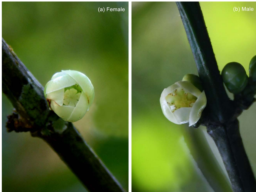
(a) Female and (b) male flowers of Garcinia gamblei .

(1) the low number of reproductively active trees in the population, (2) the rarity of seedlings, indicating low recruitment, (3) strong winds during the monsoon season damaging the large branches of mature trees, (4) an increasing number of tourists and occasional forest fires, and (5) high seed predation.