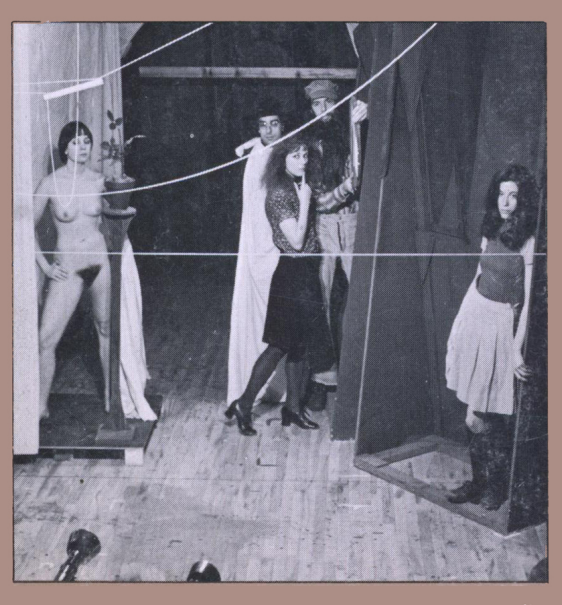
New York University/School of the Arts