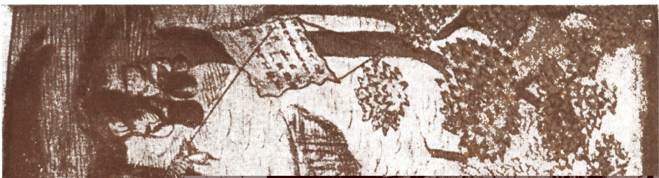
The picture on the right represents Le Clercq's characters, or prayers to the Indians. The