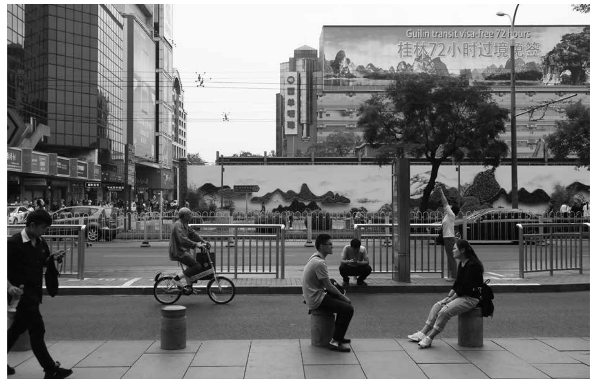
1 Xidan Street, Central Beijing.

I travelled to China for Beijing Design Week. During this short trip, I felt I couldn't comprehend Beijing at all, feeling dropped into a handful of vaguely connected moments. I first came here in 2004 and, streetside, it feels figuratively similar, the low-rise spreading city of old seemingly eaten by modernity. To every Beijing resident I asked, twelve years ago was considered as an eternity - a different world - with few points of comparison. Back then, I felt like I had witnessed what it must have been like to