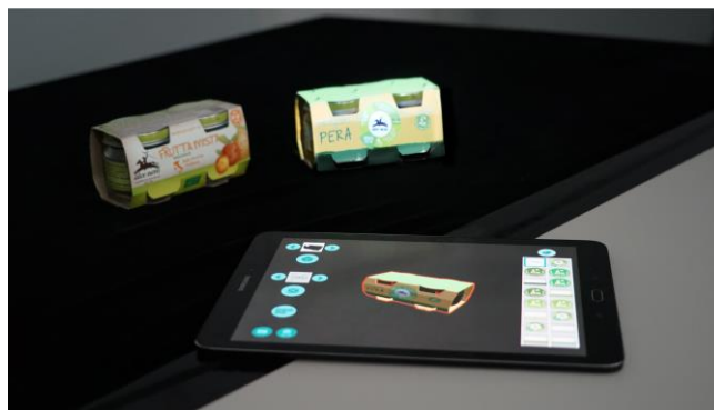
Figure 1: Some SPARK platform elements: a tablet with GUI to design onto the mixed prototype (above right), as rendered by projection. Real product on the left

According to the above premises, it appears quite clearly that there are just very few contributions which aim at using log files (or similar data sources) to infer what happened during design activities. In order to evaluate the viability of this approach and run a first estimation of the time and human resources involved, the authors opted to study collaborative design activities supported by an ICT tool that they are developing: the SPARK platform (SPARK project - http://spark-project.net - SPatial Augmented Reality as a Key for co-creativity). It exploits Spatial Augmented Reality (SAR, augmented reality displayed through projection) to support and foster collaborative creative thinking in the design process. The introduction of a mixed prototype - a tangible blank 3D shape and a virtual surface rendered on the shape by projection (Figure 1) - allows the participants to visualize a shared design representation of the solution and its evolution during the design process. This helps reduce language barriers, which can arise due to the diversity of backgrounds and level of sketching skills amongst the design team members.