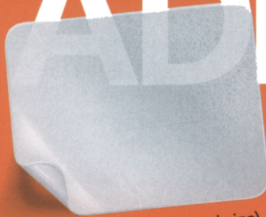
15-mg patch (actual size)