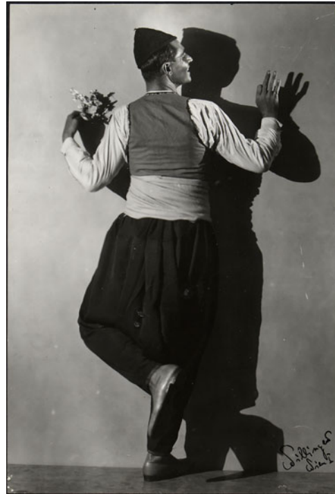
Photo 3. Baruch Agadati in Arab Jaffa (1927).

Yet, though commonly and—at least until 1936—legally practiced, homosexuality was heavily excluded from the early Zionist discourse. As Ofri Ilany has shown, in pre-State Israel and in the early years of the State of Israel, male homosexuality was regarded as a threat to the Zionist project because of the constructed cultural connection between homosexuality and the Orient.