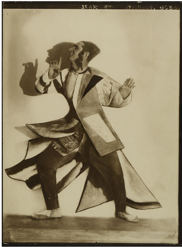
Photo 2. Baruch Agadati, Movement Study in Expressionist Dance Costume for Yemenite Ecstasy (1920). Costume and Drawing: Boris Aronson.

He became a geometricized figure in a Jewish-themed piece and danced in an angular movement style evoked by the stiffness of the expressionist costume. With the help of the costume, the reshaping or, as I am tempted to say, the queering of the body contour fostered a new and deliberately modernist visuality of the moving body.