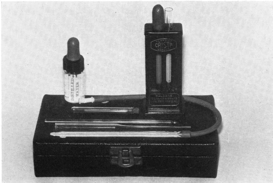
Figure 2. Haldane's haemoglobinometer with carboxyhaemoglobin standard, 100% = 13.8 g/dl.