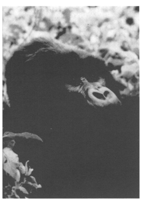
Actual size 22"×17½" * Full colour * Quality paper. Posters, Cards and Educational Displays.