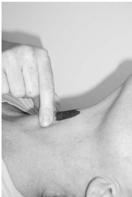
Figure 3. The application of cricoid pressure.

handed technique has been suggested [Hartely, 1993]. Extreme care to avoid head and neck movement must be taken during intubation of these patients.