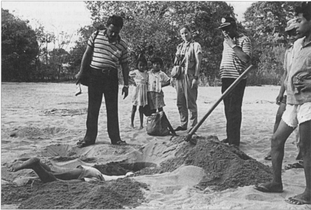
Collecting eggs at the nesting ground of the Moluccan megapode Eulipoa wallacei at Kailolo, Haruku, Moluccas, 27 October 1991 (Marc Argeloo).

population, the same system is applied as in Kailolo, although for a much smaller nesting ground. Here only a few eggs can be collected daily. The 'sasi' regulations in this village are implemented in a much stricter way. In addition to a complete ban on collecting eggs during certain months of the year, it is also forbidden to harvest other products such as fish and mangrove trees during specific periods. Even in the egg-collecting season, some parts of the nesting ground are excluded from harvesting. The 'sasi' is used in this way to safeguard the megapode population and guarantee future harvests.