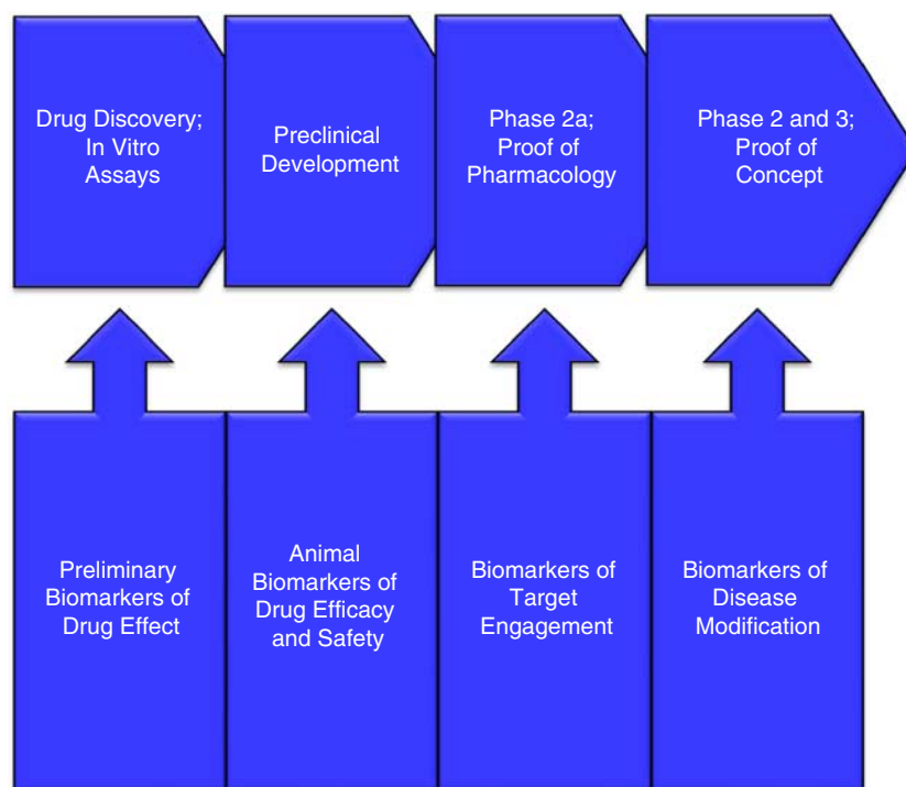
Figure 3. Role of biomarkers in drug development.

including informatics, biostatistics, data integration, computational biology, simulation and modeling, network analysis, and knowledge assembly is required to interpret the huge inventories of data generated by microarray and mass spectrometry studies. 48,50,51 This level of analysis is sometimes called quantitative biology, and systems and quantitative biology promise to become informative tools for drug discovery and development. 51 Translational informatics attempts to directly derive clinically relevant information from the vast omic data. 52