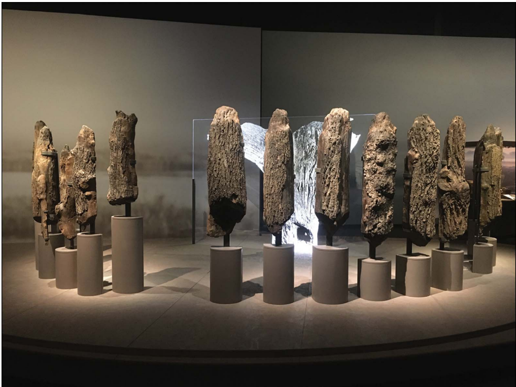
Figure 6. The Seahenge display in the WoS exhibition.

From these reactions we surmise that successful alternative icons are about more than changing approaches to the selection and written interpretation of objects. To offer alternative