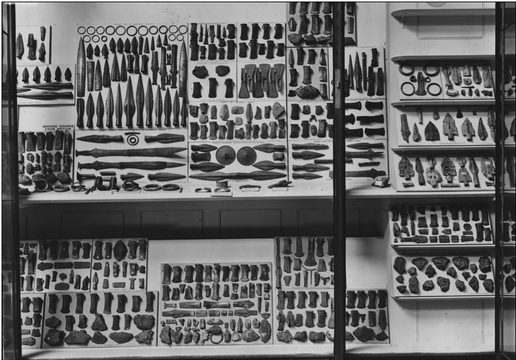
Figure 1. Later prehistoric objects on display in the British Museum in the early twentieth century (photograph © The Trustees of the British Museum. Shared under a Creative Commons Attribution-NonCommercial-ShareAlike 4.0 International (CC BY-NC-SA 4.0) licence).

Recent research on the history of acquisition at the British Museum has shown that finds from archaeological excavations in Britain (primarily England) represent around one-third of the entire collections database, approximately 1.5 million objects (MacDonald 2022: 5). The vast majority of these were excavated and acquired between the 1960s and 1990s, a time of expanding awareness of the analytical and scientific potential of the archaeological record linked to the rise of ‘new archaeology’ (Clarke 1973). Before this, the retention and preservation of archaeological material was far less complete. Most European national museums contain a nucleus of prehistoric objects gathered by nineteenth- and early-twentieth-century antiquarians, archaeologists, collectors and curators (Amkreutz 2020). These collections are typically composed of relatively small, visually striking and durable artefacts perceived to have strong cultural, social or ethnic signification during prehistory. Somewhat paradoxically, between the mid-nineteenth and mid-twentieth centuries there was a policy of near total display of those objects which were in collections in most UK museums (Figure 1). In contrast, from the 1970s onwards there was a process of ‘iconification’ as the most remarkable and extraordinary objects were asked to stand for whole periods and geographies (Figure 2)—an approach that