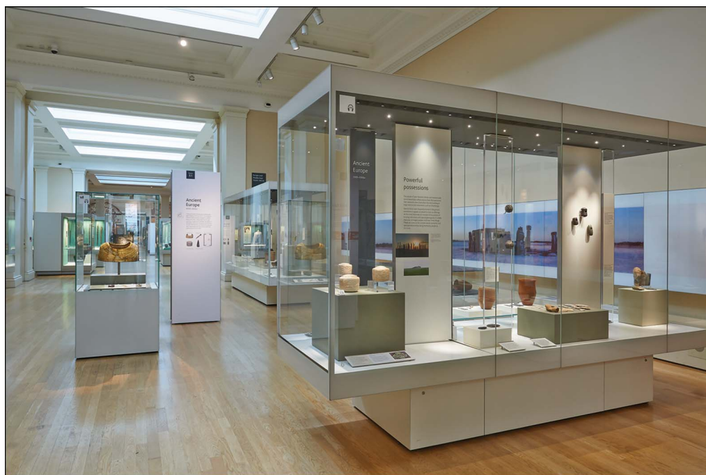
Figure 2. Neolithic and Bronze Age objects on display in Gallery 51 at the British Museum today (photograph © The Trustees of the British Museum. Shared under a Creative Commons Attribution-NonCommercial-ShareAlike 4.0 International (CC BY-NC-SA 4.0) licence).

The resulting icon-oriented approach to display has had significant curatorial consequences. Firstly, while single objects can have many layers of meaning (Cooper et al. 2021: 135–43), they are more limited in what they can convey about complex processes (e.g. an axe displayed simply as a token of lifestyle or identity, rather than as one object of