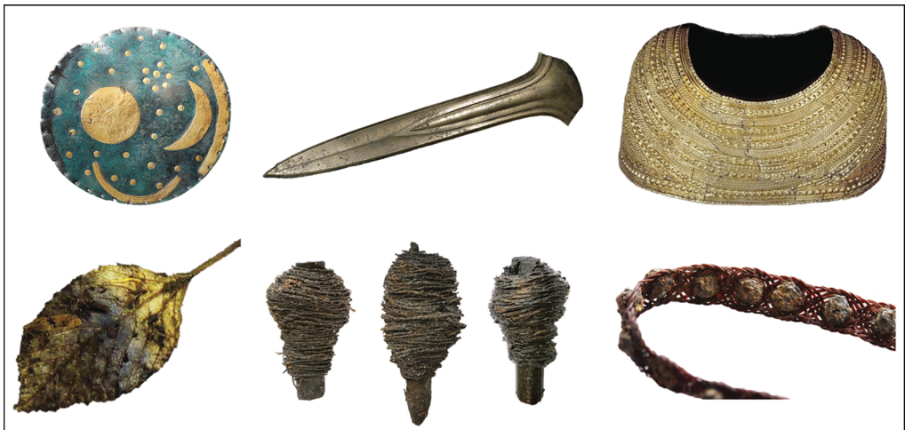
Figure 4. Icons (top row) and alternative icons (bottom row) in the WoS exhibition: Nebra Sky Disc; Oxborough dirk; Mold Gold Cape; Windy Harbour leaf; Must Farm thread on dowels; White Horse Hill cattle hair bracelet with tin studs (note: objects are not to scale) (photographs by State Office for Heritage Management and Archaeology, Saxony-Anhalt/Juraj Lipták; Trustees of the British Museum (CC BY-NC-SA 4.0); Oxford Archaeology; Cambridge Archaeological Unit; Plymouth Museum).

The first landscape zone (Forest, entitled ‘Working with Nature’) explored the transformations of the British landscape from the start of the Neolithic. A 6000-year-old elm leaf from recent excavations by Oxford Archaeology at Windy Harbour, Lancashire, was presented as an emblem for the fragility of the natural world. Strictly an ecofact (one of many recovered