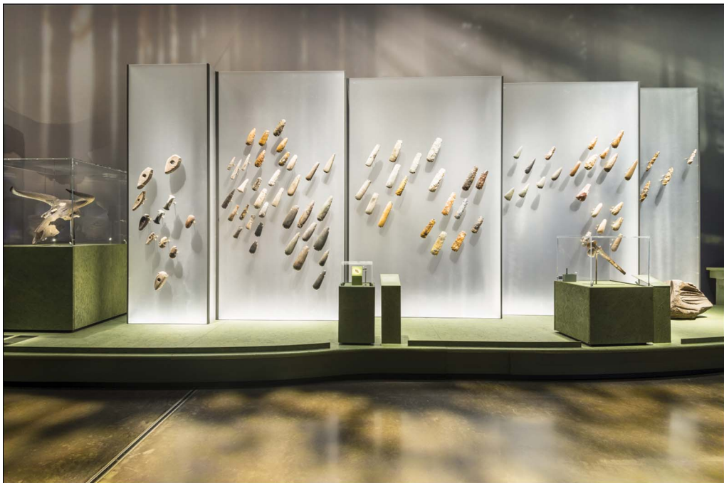
Figure 5. The ‘axe wall’ in the WoS exhibition (photograph © The Trustees of the British Museum. Shared under a Creative Commons Attribution-NonCommercial-ShareAlike 4.0 International (CC BY-NC-SA 4.0) licence).

Although the exhibition narrative of WoS was framed around the rise and fall of Stonehenge, with key objects from the monument and its landscape woven throughout, it also sought to subvert the monument’s iconic status by highlighting other, less famous, contemporary sites. The Early Bronze Age timber monument known as ‘Seahenge’ (Holme-next-the-Sea, Norfolk) was discovered in 1998 (Brennand et al. 2003) (Figure 6).