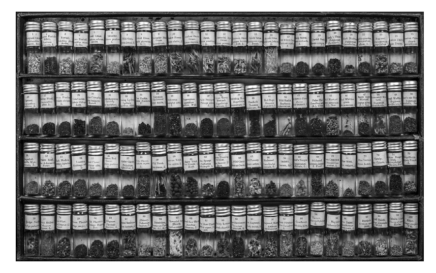
Figure 10.3 This 1906 reference collection of 'economic plants' includes both crop and weed seeds of Canada.

use at agricultural research institutions, including seed-testing stations, would contain examples of agricultural crops as well as weeds, the latter regardless of whether they could be used as source indicators (Figure 10.3).<sup>32</sup> By virtue of including a wide range of plant material, local and global, these herbaria were (and are) suited to dealing with varied needs of researchers and farmers. In contrast, the Whipple's seed herbarium was tailored to a single task: the identification of a seed's place of origin.