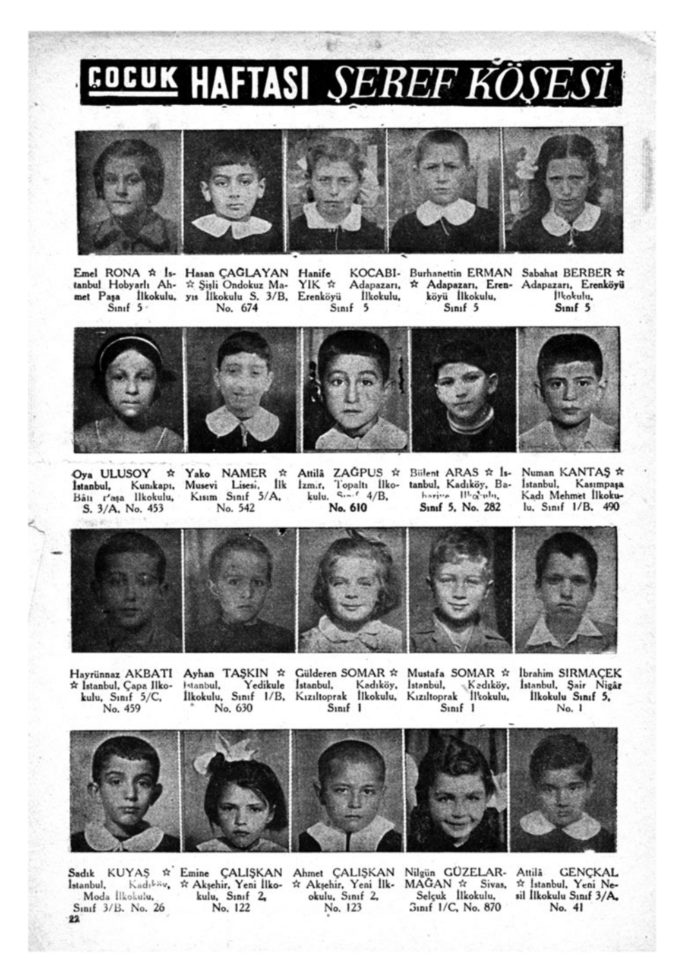
Figure 1. Çocuk Haftası's honorary corner.

write in a short, concise, and legible manner.<sup>22</sup> However, since the magazine lasted for only a few more issues, Çetin never got to publish anything.