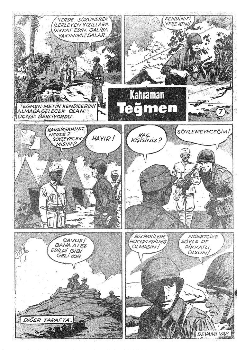
Figure 4. "The Hero Lieutenant."

location of enemy forces on the map, these are represented by Japanese flags. In another scene, in the seventh installment, a Japanese flag again appears in the "North Korean" camp (Fig. 4, third panel).<sup>47</sup> The animation style is also very different from other comic strips and cartoons published by this magazine, being more detailed and mature. In addition,