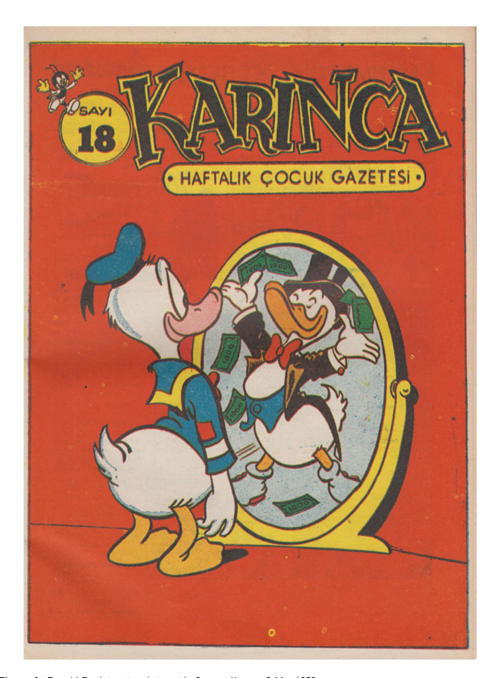
Figure 6. Donald Duck imagines being rich. Source: Karınca, 3 May 1952.

which Goofy is one of the ten worst dressers in the city (it does not say which city). When Mickey criticizes the poor state of Goofy's clothes, the latter replies "What about it? I have lived with these clothes for years like a close friend!" The shocked Mickey then decides to take Goofy to a tailor to buy some new clothes. After the tailor promises to bring Goofy new clothes made especially for him (which he delivers immediately), Goofy agrees to try them on. Upon seeing his reflection in three mirrors in the store and mistakenly thinking they are other people, he accuses the tailor of trying to cheat him because "he had already