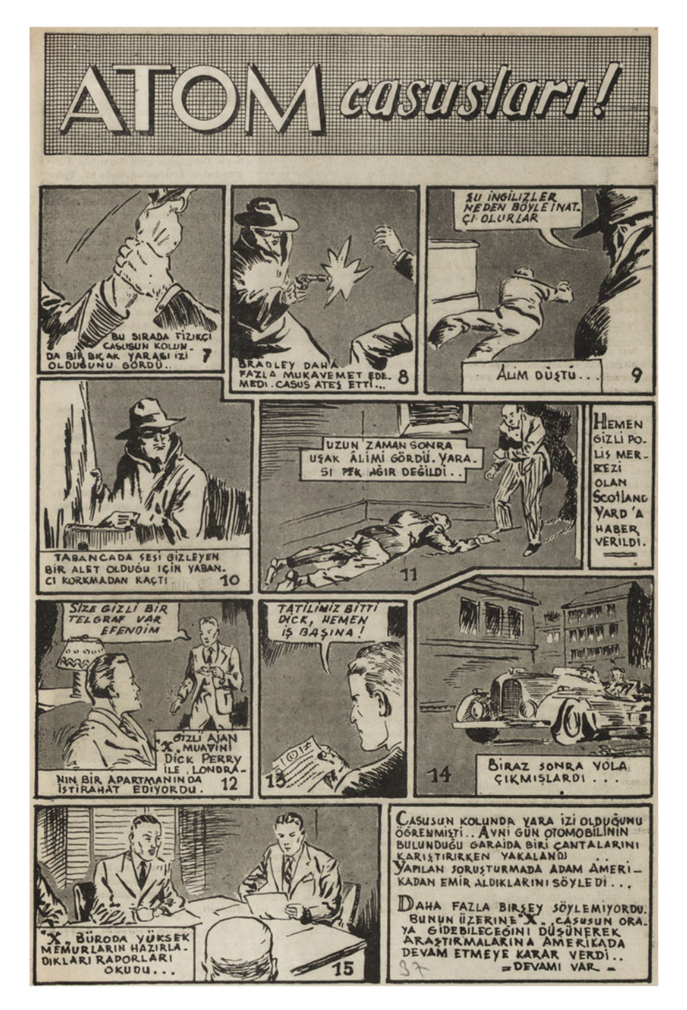
Figure 2. "Spies of the Atom!" part 2.

Although I have been unable to find the original comic, it is clear that it is not Turkish in origin: the heroes are foreigners, the story begins in London, and Special Agent X serves Scotland Yard. Either this is a British comic translated into Turkish, or it was originally an older crime-oriented comic repurposed by the publishers, who rewrote the dialogue to