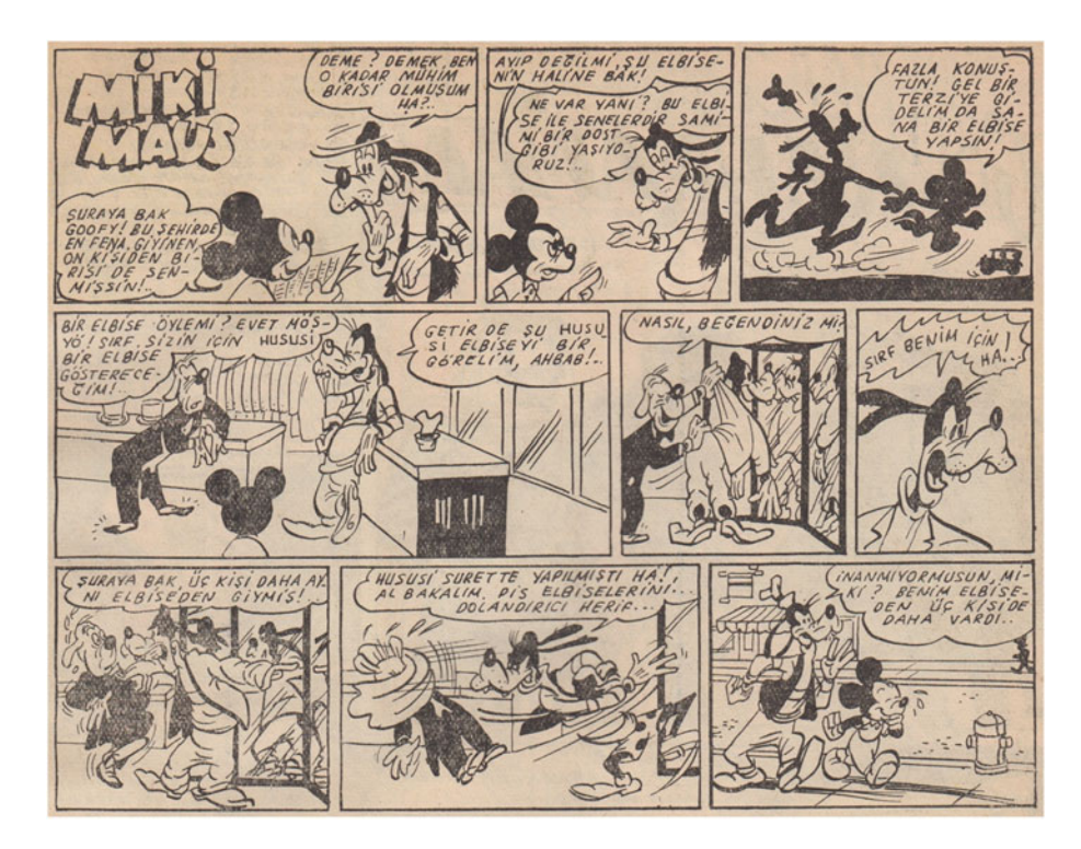
Figure 7. "Mickey and Goofy Buying Clothes."

seen three other people wearing the same 'special' outfit." The annoyed Goofy throws the clothes at the surprised tailor and storms out, where he complains to Mickey (Fig. 7).<sup>69</sup>