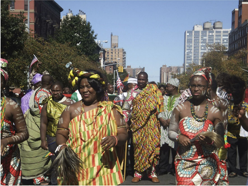
Figure 15. Participants celebrating the African Day Parade in Harlem on September 23, 2012.

and moved into a niche of the economy. However, despite their extensive community-building work and commitment to raising their children in Harlem, they are increasingly being displaced, again, by relentless gentrification.