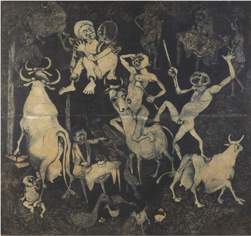
Figure 11. Dumile Feni, African Guernica (1967), charcoal on paper.