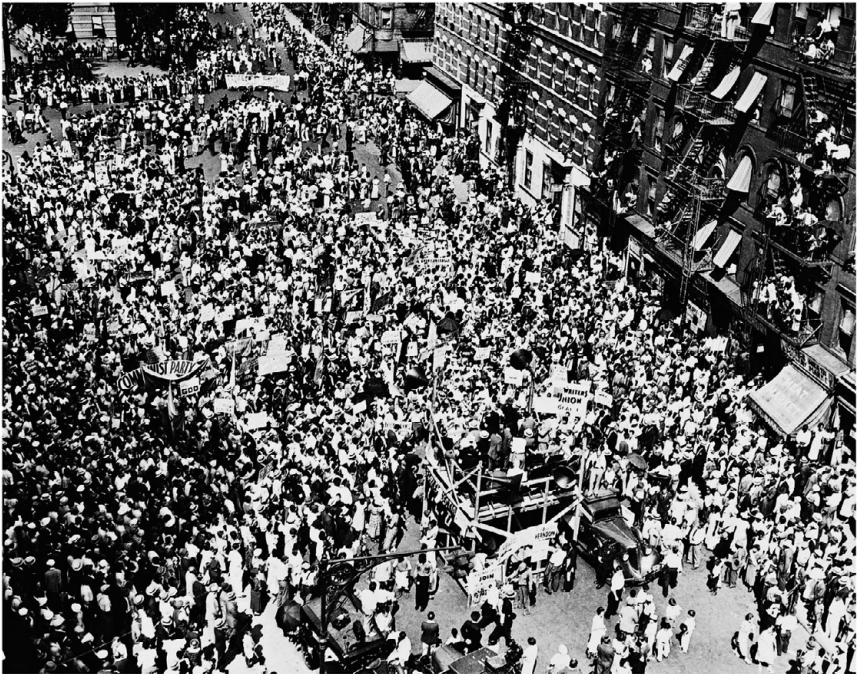
Figure 4. Thousands of Harlem residents protest Italy's invasion of Ethiopia, 1935.

The Garvey Movement co-existed, in considerable tension, with socialist and communist organizations and activists. One notable socialist organization was The Council of African Affairs, founded in 1937 by Paul Robeson, W.E.B. DuBois, and Alphaeus Hunton, Jr. 19 It played a major role in keeping Harlem informed about colonial oppression and the decolonization of Africa. The Council operated into the 1950s for the liberation of African countries [see Figure 5], and benefitted from an alliance and eventual merger with the Communist Party, which joined them in launching educational initiatives regarding the exploitative nature of colonialism.