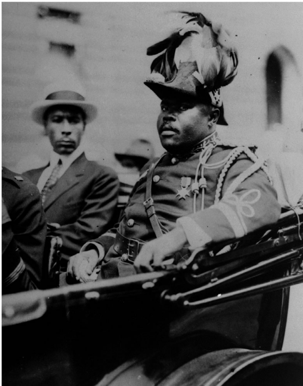
Figure 3. Marcus Garvey, 1922.

The interwar period had vast mobilizations in response to the Great Depression and Mussolini's invasion and occupation of Ethiopia (1935–1941). 17 Harlem's anti-colonial mobilization led to volunteer campaigns, fundraisers, and propaganda dispersed through a network of Black newspapers. Protest erupted with a rage