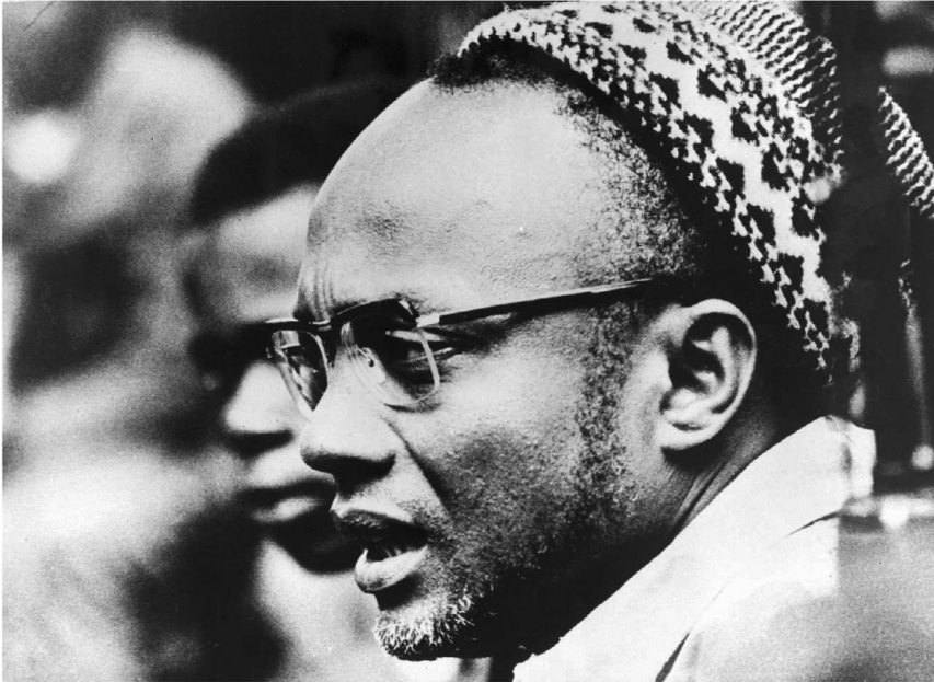
Figure 1. Amílcar Cabral.

struggle from the late nineteenth century conquest and colonization of Africa to the establishment of majority rule in the 1990s.