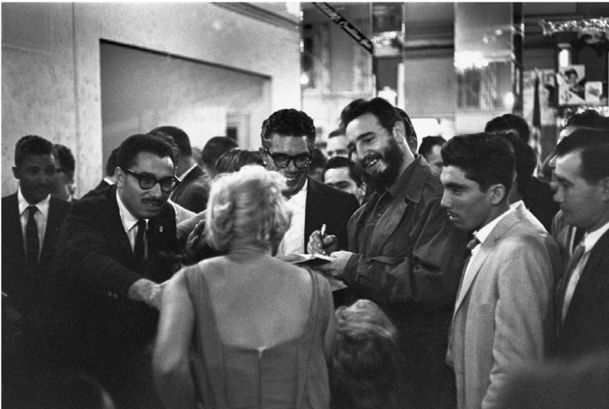
Figure 9. Journalists greet Castro at the Theresa Hotel in Harlem.