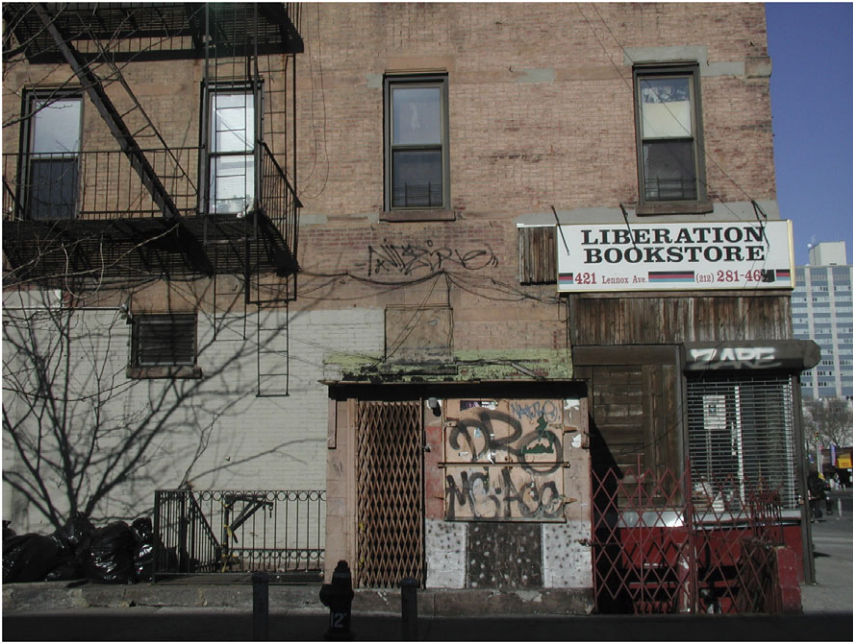
Figure 14. View of closed Liberation Bookstore on corner of 131st St. and Lenox Ave. [iStock by Getty Images].