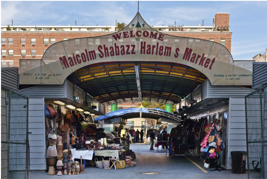
Figure 18. Malcolm Shabazz Harlem Market.

the Harlem Hospital join us in this work. My present project will involve several people from this formative period and will document and raise awareness of Harlem's rich, radical, and redemptive role in pan-African history.