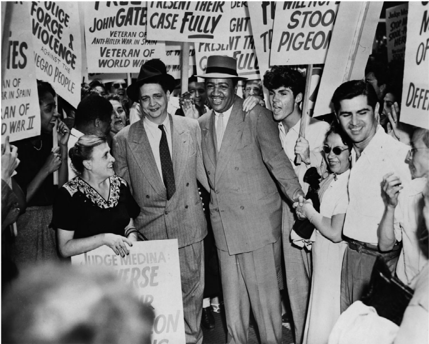
Figure 6. Benjamin Davis stands with supporters.

asked “Sister, I hear you believe in integration.” I was completely stunned. “Weren’t we all struggling for this?” I asked myself. This was my introduction to Black Power and a dramatic example of the transition underway in the Civil Rights movement. The classrooms at SIA were astir with conflict and debate between radical students (often Peace Corps returnees from the Teacher’s College) and the complacent majority training for positions in international corporations or the State Department. Predictable debates about the Vietnam War and imperialism erupted in classrooms, and conservative faculty were vehemently challenged. These debates percolated and combined with Black student activism concerning Columbia’s relationship with Harlem, culminating in the 1968 Columbia Strike. 20