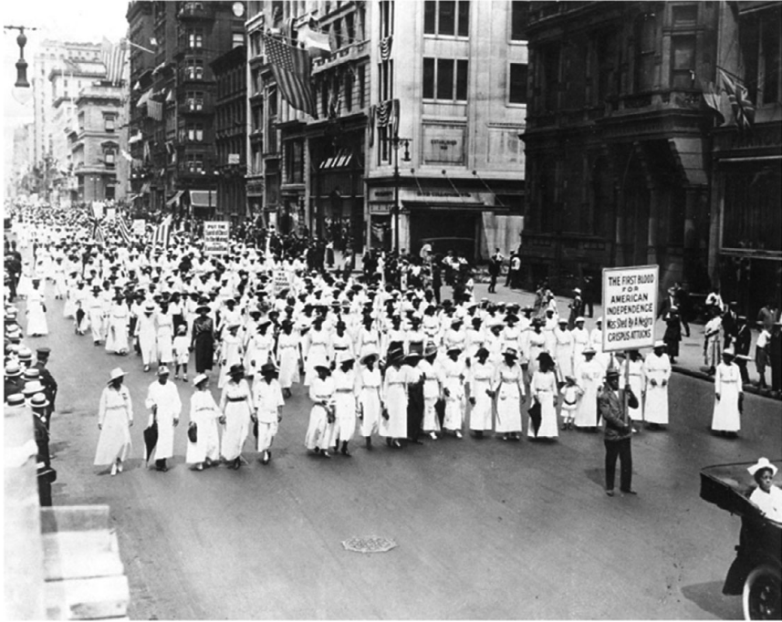
Figure 2. Silent March 1917.

space, whose nature and character was defined by the social, intellectual, and artistic energy of the Harlem Renaissance. 13 One of the key figures of the Renaissance was the Black Puerto Rican Arturo Alfonso Schomburg (1874–1938), who came to New York City at the age of seventeen and participated in the Cuban and Puerto Rican independence movements. During the Harlem Renaissance, Schomburg devoted his life to collecting Black memorabilia and printed works to refute a claim made by a teacher in Puerto Rico that Black people lacked culture and history. In 1926, he sold his archive of over 10,000 items, including Frederick Douglass' newspapers, poems, the correspondence of Haiti's liberator Toussaint L'Ouverture, and music by Chevalier de Saint-Georges, the eighteenth-century Black French composer and revolutionary. 14 Schomburg's interest in the African diaspora and the collection itself continued to cement the linkage between East Harlem and Central Harlem, both areas with Black populations and an interest in deepening the knowledge about the important role of Africans in shaping the Caribbean and the Americas.