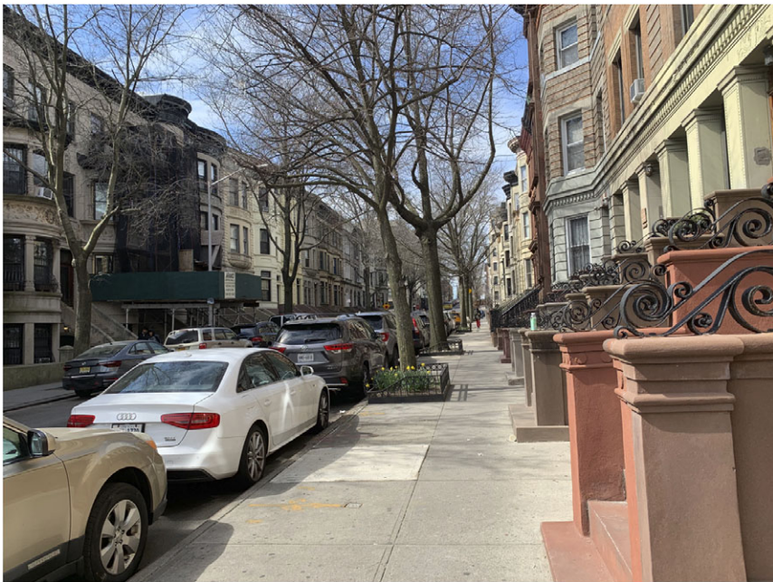
Figure 7. West 147th St. between St. Nicholas Ave. and Convent Ave.

This is when I became aware of the Black Canadian movement. I attended the 1968 Montreal Congress of Black Writers Conference, which included a roster of prominent Black writers and activists, among them C.L.R. James, Robert Hill, and Kwame Ture (Stokely Carmichael). It was there that I learned about the descendants of the Jamaican maroons who relocated to Halifax, Nova Scotia. I met