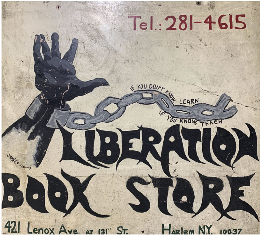
Figure 13. Liberation Bookstore original sign.