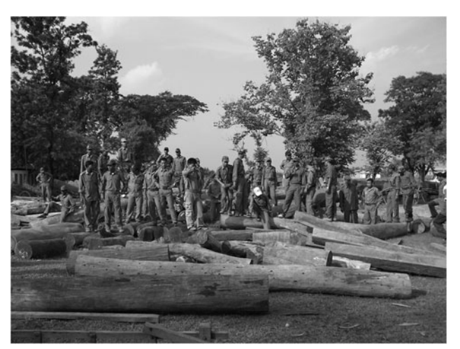
PLATE 1 Bodoland Forest Protection Force members with confiscated materials at Kachugaon base camp.

The Bodoland Forest Protection Force has been patrolling the forest since April 2006 (Plate 1), supported by the Bodoland Territorial Council, with two patrolling trucks and one large logging truck. Coordinated by RI, it is stationed at Kachugaon and Raimona within the Kachugaon and Ripu Reserve Forests, respectively. Volunteers patrol day