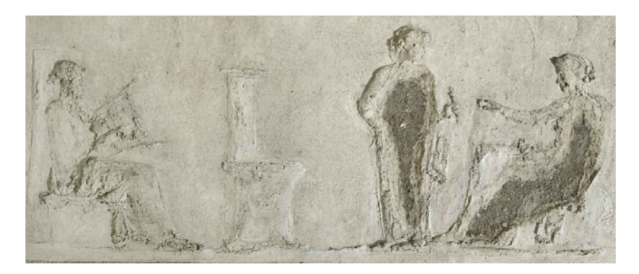
Figure 2a. Detail of a panel from the vault of the right nave of the underground Basilica near Porta Maggiore.