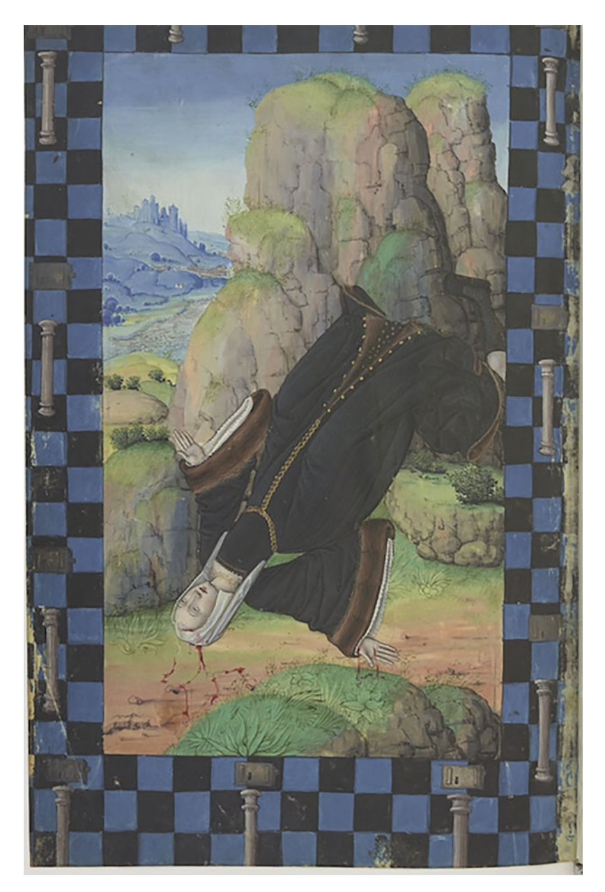
Figure 3. Parisinus Fr. 874, fol. 197v.