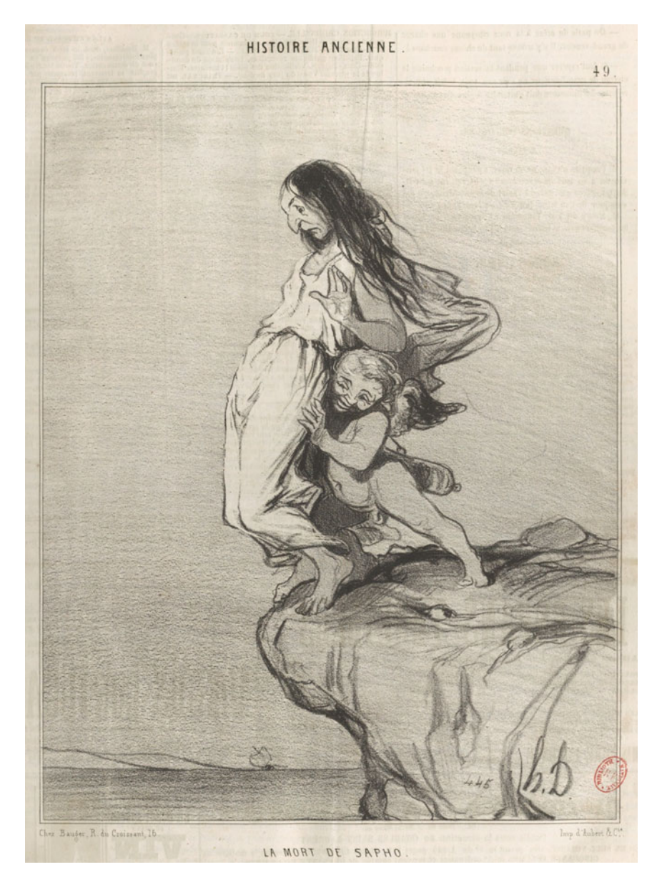
Figure 6. H. Daumier, La mort de Sappho, published in Le Charivari, 4 January 1843.