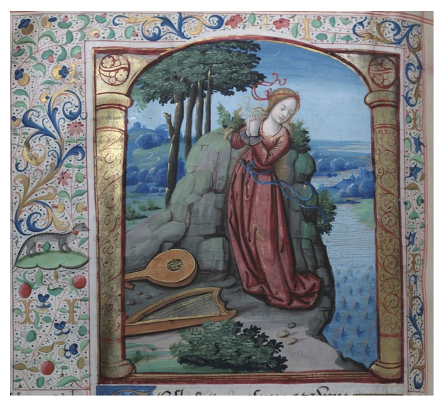
Figure 4. Oxford, Balliol College Libr., 383, fol. 167v.

(1510–11), which also (albeit in a very different way) reflects the legacy of the Ovidian Epistle if, as it has been convincingly assumed, the roll with her name the poetess holds in her left hand is to be interpreted as the famous signature/name of the Epistle itself.<sup>63</sup>