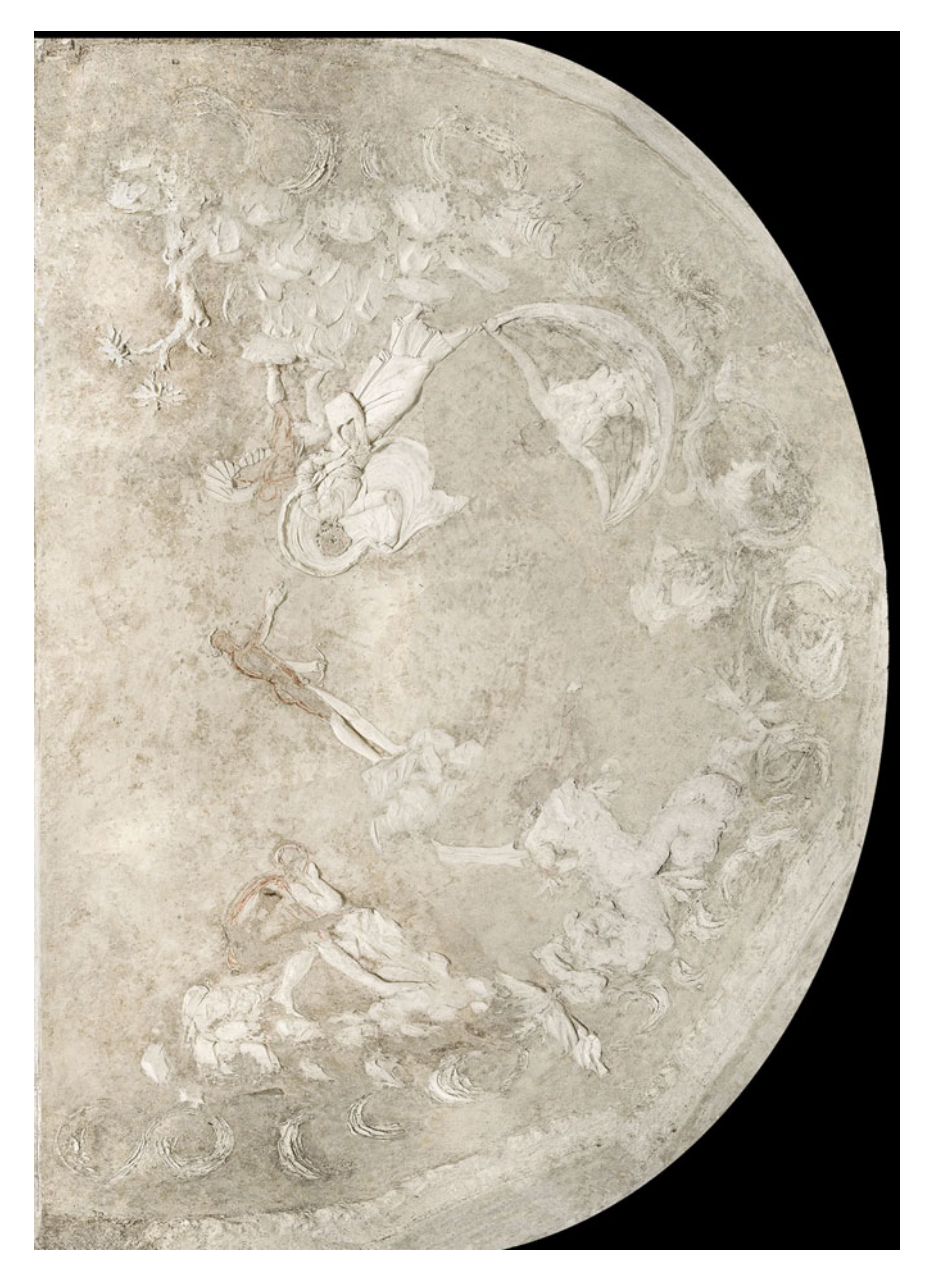
Figure 1. The apse of the underground Basilica near Porta Maggiore after the most recent restoration.