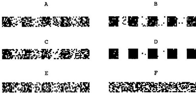
Figure 1. Dennett's Six Frames (1991, 31).

localized material thing between atoms). The energetic conception is in line with modern approaches in quantum chemistry (namely the MO approach and its variants) and is consistent with views that reject the existence of chemical bonds (at least) as material parts of molecules (see Coulson 1955). 8