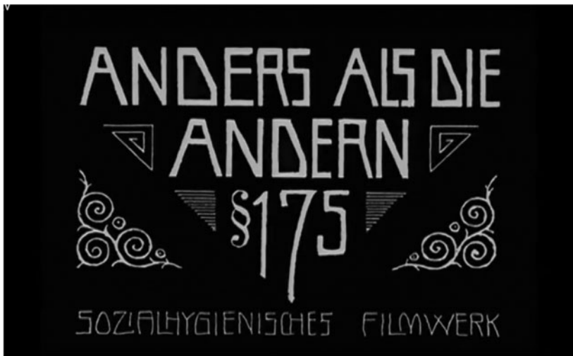
Filmmuseum München initial title card

the film within its revolutionary context. It presents the audience with a “brochure” to read, historicizing the experience.