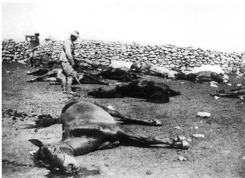
Figure 1. The corpses of horses slaughtered in battle.