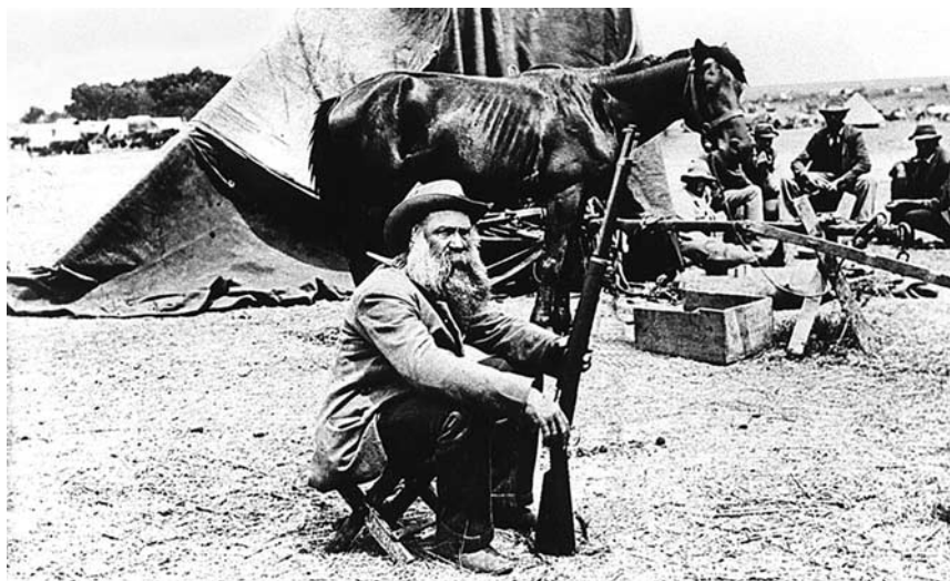
Figure 2. A Boer combatant and his emaciated horse.

Reitz observed as the war wore on that the Boers presented “long columns of shaggy men on shaggy horses”. On the other hand, he noted, the officers at General Smuts’s headquarters, in friendly derision, referred to the staff officer equivalents as kripvreter s (stall-fed horses who did not have to scavenge their food from the veld like ordinary horses).