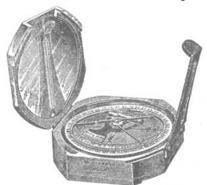
Brunton Pocket Mining Dial in leather sling case £21 0s. 0d.

Write for list "G.M." for further details of Compasses, Clinometers, Levels, Telescopic and Hand (Abney pattern). Soil Samplers, Surveying Instruments and Forestry Tools of all kinds; also Optical Instruments, including Telescopes, Binoculars and Magnifiers, Rangefinders, Stereoscopes, Altimeters: Geological Hammers, New Pattern Steel and Linen Tapes, Plane-Tables and Alidades, Tally Counters, "Leroy" Lettering Equipment (Keuffel and Esser).