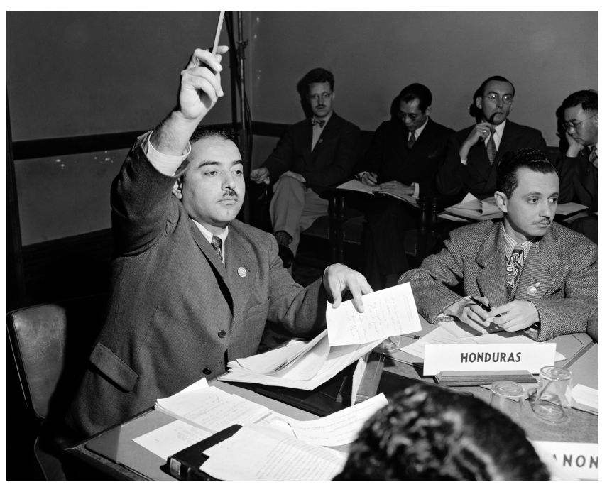
FIGURE 1.1 Djalal Abdoh, then a deputy of the Majlis, at the San Francisco Conference, at which the United Nations was founded, April 25, 1945. Source: UN Photo/Rosenberg. Courtesy of the United Nations Photo Library, Photo No. 84190.

divide on a material basis by which unfair mechanisms enriched one half of the globe and impoverished the other. The dominant forces that concerned him were not directly associated with the Cold War struggle for global primacy. Neither was the question of sovereignty viewed as a capitalist-socialist disagreement over the sanctity or vulgarity of private property. Instead, he insisted that the prolongation of imperial economic thralldom stood against the new era of decolonization.<sup>7</sup>