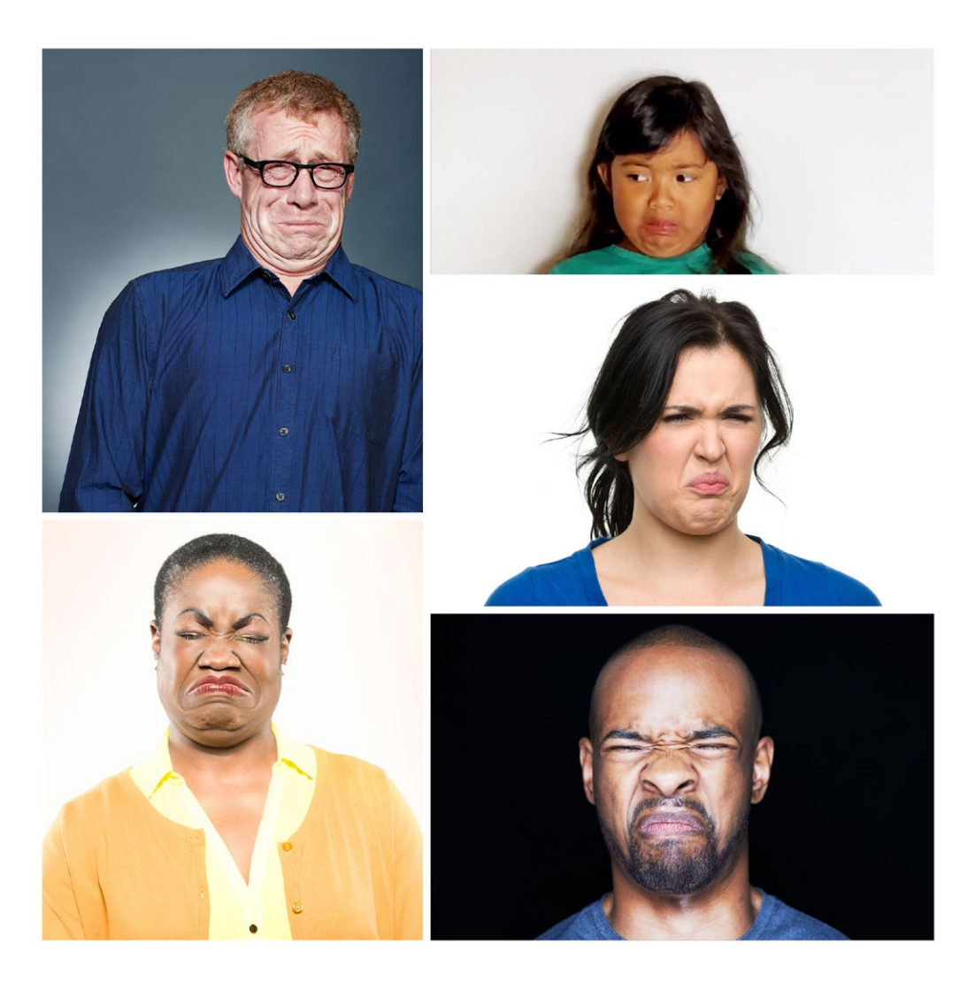
Special Issue: Disgust and Political Attitudes

Vol. 39, No. 2 www.cambridge.org/pls Fall 2020