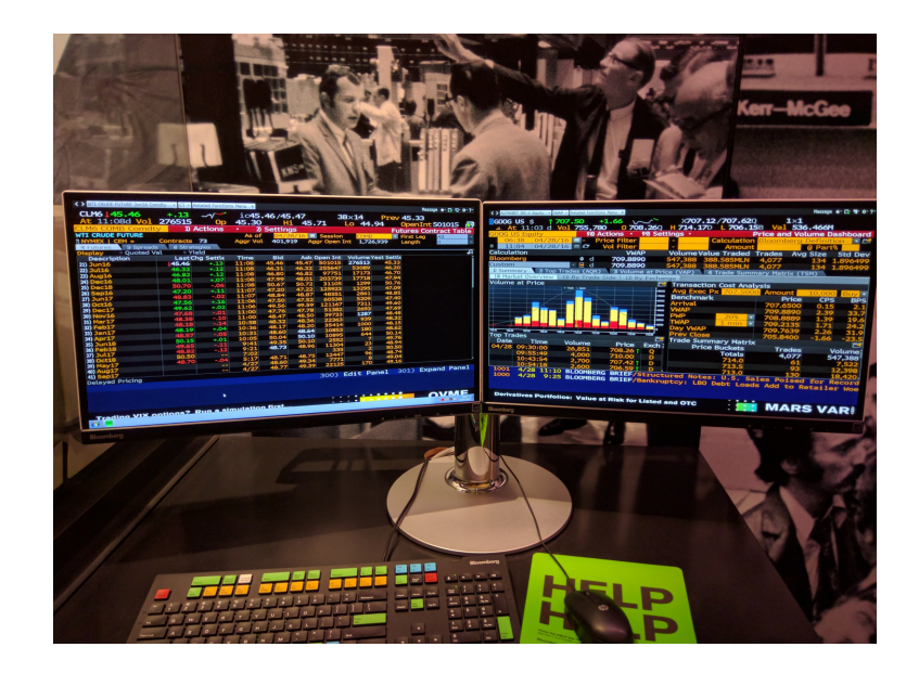
Figure 1. The current Bloomberg Terminal in a dual-screen configuration.

The Bloomberg Terminal, or more accurately, the online data and information services marketed under the banner of Bloomberg Professional, made its initial appearance in December 1982, and has become an enduring, even iconic, tool in the history of computing, to the extent that various models appear in Silicon Valley's Computer History Museum and in the Smithsonian's National Museum of American History (McCracken, 2015).