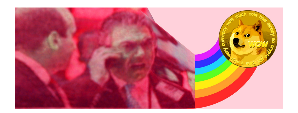
Figure 4. Image from 'Changing the Image of Finance' workshop, 2016.

This process was conceived as a prompt for critical thought, but also as a productive tool to create new images by combining existing ones. These new images provided a basis for conversation with multiple entry points, hooking people into an imaginative process in order to engage them to conduct critical conversations about art and finance.