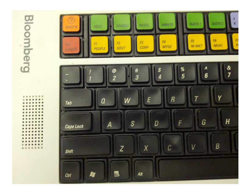
Figure 2. The Bloomberg Terminal keyboard.

The Bloomberg Professional service can be accessed through PCs, tablets, and smartphones, though its most iconic manifestation is through the Bloomberg Terminal, a dual-screen monitor with a fingerprint scanner and specialised, colour-coded keyboard that offers immediate access to areas such as EQUITY, NEWS, COMMODITY, CORP and GOVT. Although art investment has become an important asset class, there is no direct ART key.