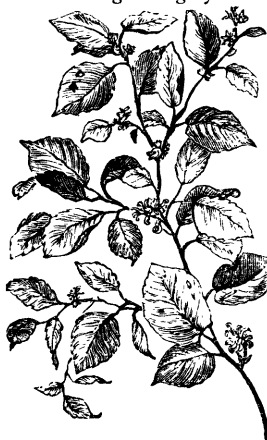
The Witch Hazel Plant.

This drug is highly commended by the British