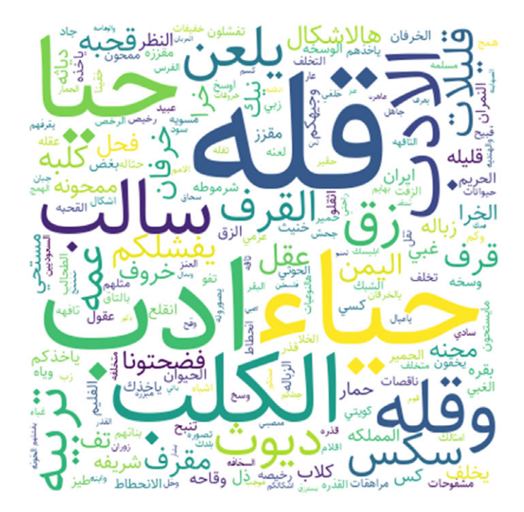
Figure 7. Offensive words (including vulgar words).