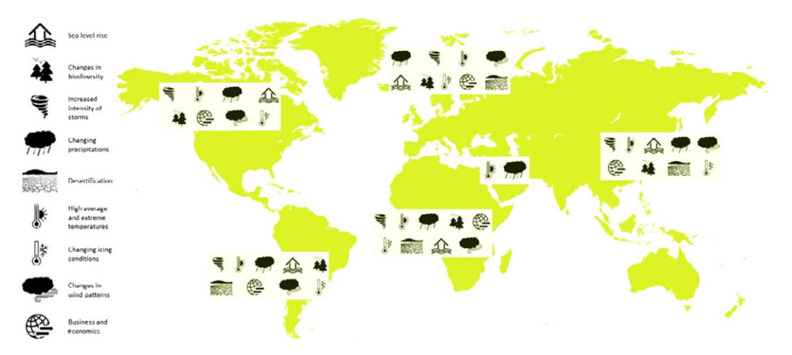
Figure 2. ICAO 2019 International Climate Change Risk Map.

Thirty percent of corresponding nations already had implemented some climate change adaptation measures, another 25% were planning to do so within ten years, and only 6% of states had no such plans. There is a general accord amongst respondents and expert authors that present adaptations are inadequate. Based upon responses, ICAO created a risk map, reproduced in Fig. 2.