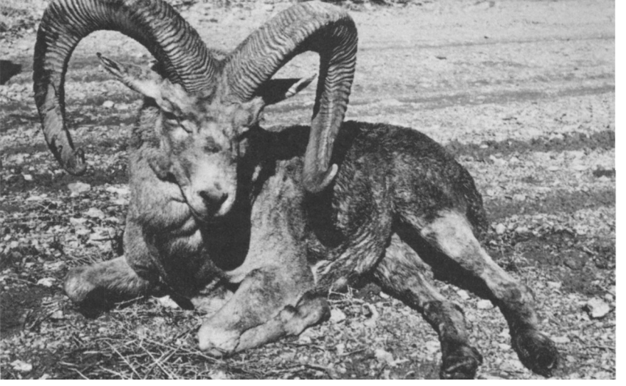
WILD SHEEP-a male about seven years old M. E. Taylor

there is at least an equal number of females, there would be at least 250-300 ibex on this mountain alone, and a conservative estimate of ibex in the reserve would be 500+100.