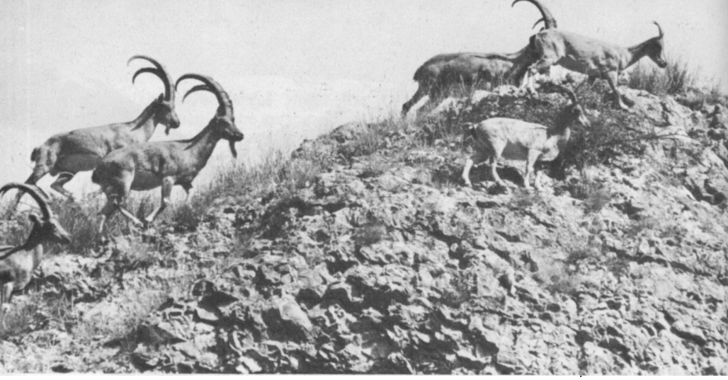
IBEX Eskandar Firouz

which the true ratio of lambs to mothers cannot be accurately estimated.