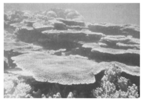
above: Philippine coral reef with Acropora coral A. White

The massive slow-growing corals such as Goniopora and Porites , which form the basic structure of the reef, are increasingly used for public buildings, particularly for airports, hotels and restaurants, despite efforts to halt this. The ornamental coral trade uses the smaller branching corals which are equally important in terms of the habitat they provide for fish and invertebrates. Throughout the early 1970s the Philippines was by far the largest exporter of such corals: exports increased from just over 200 tonnes in 1969 to over 1800 tonnes in 1976, about 60 per cent destined for the US and the rest going to Japan and Europe.<sup>22</sup> It is also the main exporter of ornamental shells, about 4000 tonnes being exported annually.<sup>23</sup> Fishermen started coral and shell collecting as a sideline to augment their meagre incomes but it became so profitable, with the rapid