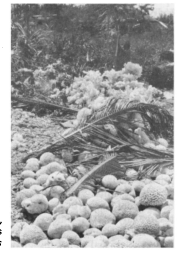
right: Stony corals bleaching in the sun, Mactan Islands, Philippines