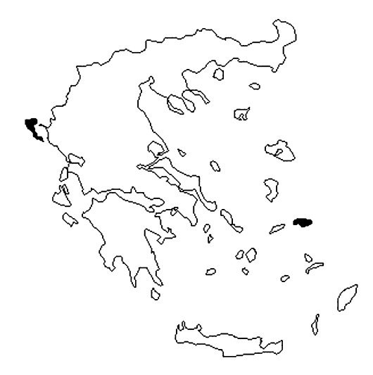
Fig. 1 Study setting: the island of Corfu is situated on the upper western border of Greece and the island of Samos is on the eastern border

Subjects' height was measured with a stadiometer and their weight with an analogue scale that was calibrated regularly (Seca 789). All anthropometric measurements were taken in morning hours (08.00–11.00 hours), in school, by the same experienced physicians. Body fat was not measured, as most participants felt embarrassed to undress in front of their classmates. Data were compared with the latest growth curves for US children<sup>(4)</sup>, as growth