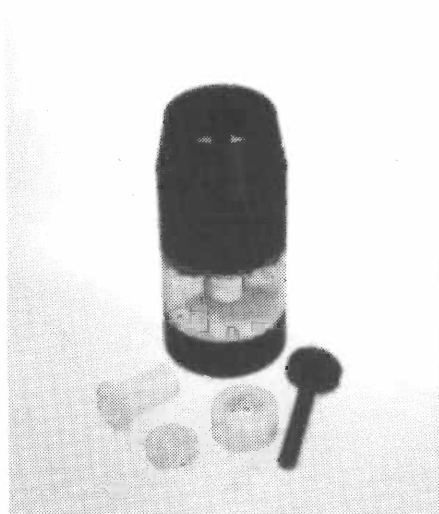
Fig. 2. Wallace 0.3-ml Teflon minivial

Thus, it is desirable to measure a sample in the minimum optical volume. Dilution of the sample into a larger volume has no advantage, because background will increase accordingly and counting efficiency will not improve.