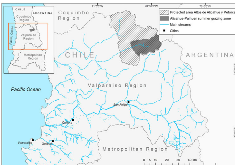
Fig. 1 The study area, Alicahue and Paihuén community summer grazing area, in the Valparaíso region of central Chile.

We analysed the transcripts with Atlas.ti 7.5 (Muhr, 2016) to identify the participants' subjective theories, using