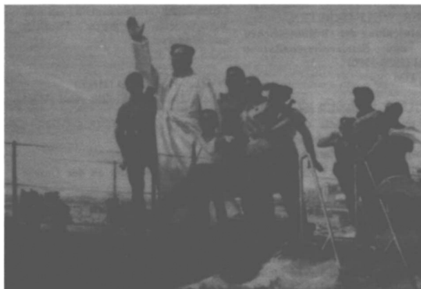
From Painters and Politics in the People's Republic of China