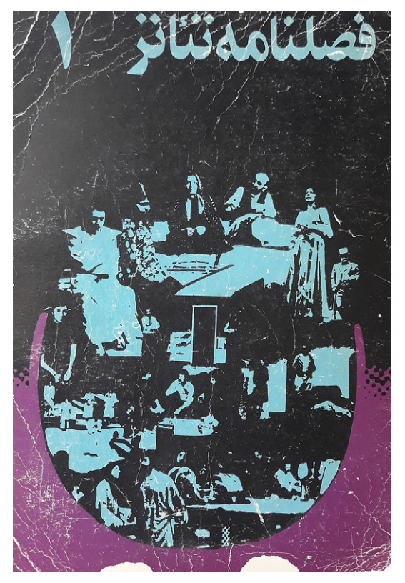
Figure 1. Cover of the first issue of Faslnameh Teatr , 1977.

Translation and creation of texts on western theatre (for one part, the presentation of theatre personalities: authors, directors, and scenographers and their work; also, full translations of essential writings offering theoretical and scientific explanations