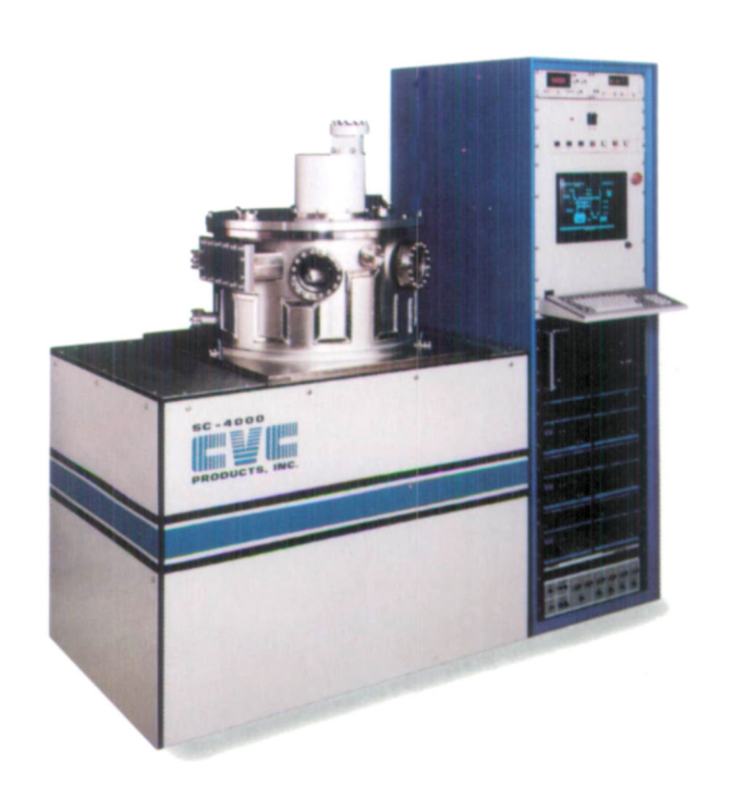
CVC SC-4000 deposition system with load lock

CVC can put superconductivity to work for you. We can deposit the High Tc superconducting thin films you need. Or build a system for you and show you how to make them yourself. We guarantee our films to be superconducting above 77 K. Order a YBCO film on zirconia and see the performance for yourself. We can also deposit other compositions and buffer layers on various substrates. To make your own thin films, order the CVC SC-4000 superconductor system. The versatile SC-4000 can be equipped with: high temperature heat for insitu anneal; substrate rotation, rf bias, rf and dc sputtering sources; evaporation sources, ion gun, laser, auto process control and load lock. Call us today to discuss your superconducting thin film requirements— (800) 448-5900, in NY (800) 962-5252.