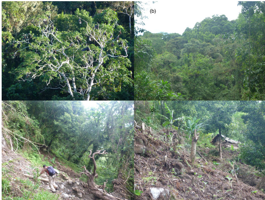
PLATE 1 Livingstone's fruit bat Pteropus livingstonii roost sites on the islands of Anjouan and Mohéli in the Comoros archipelago (Fig. 1). (a) View of the Moya roost from the survey point; (b) undisturbed forest at the Fomboni roost; (c) landslide at the Ouzini-Moihajou roost; (d) unstable soil resulting from recent land clearance for agriculture at the Mpage roost.

community members with variable levels of training and access to survey equipment, and the reliability of these counts has never been assessed. The current study used a small number of well-trained and experienced observers, who conducted simultaneous counts at sites, and therefore the estimate reported here is likely to be the most reliable to date.