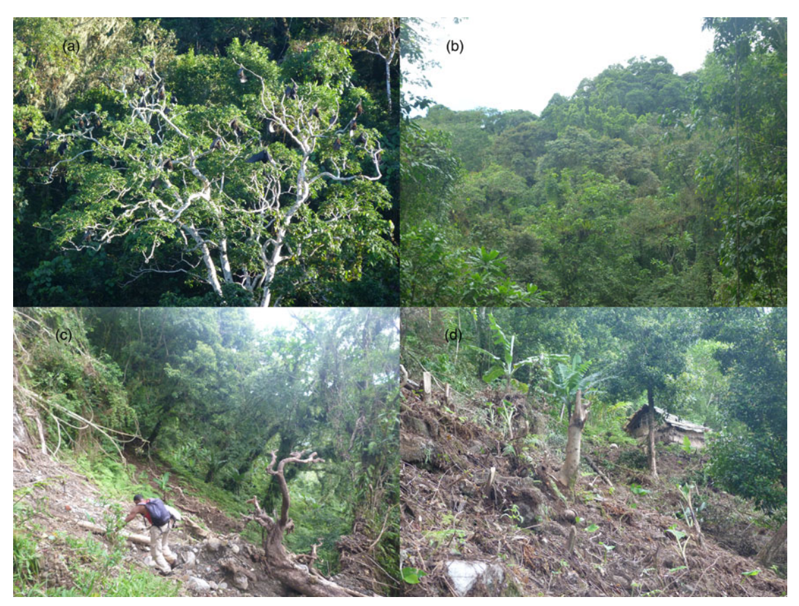
PLATE 1 Livingstone's fruit bat Pteropus livingstonii roost sites on the islands of Anjouan and Mohéli in the Comoros archipelago (Fig. 1). (a) View of the Moya roost from the survey point; (b) undisturbed forest at the Fomboni roost; (c) landslide at the Ouzini-Moihajou roost; (d) unstable soil resulting from recent land clearance for agriculture at the Mpage roost.

community members with variable levels of training and access to survey equipment, and the reliability of these counts has never been assessed. The current study used a small number of well-trained and experienced observers, who conducted simultaneous counts at sites, and therefore the estimate reported here is likely to be the most reliable to date.