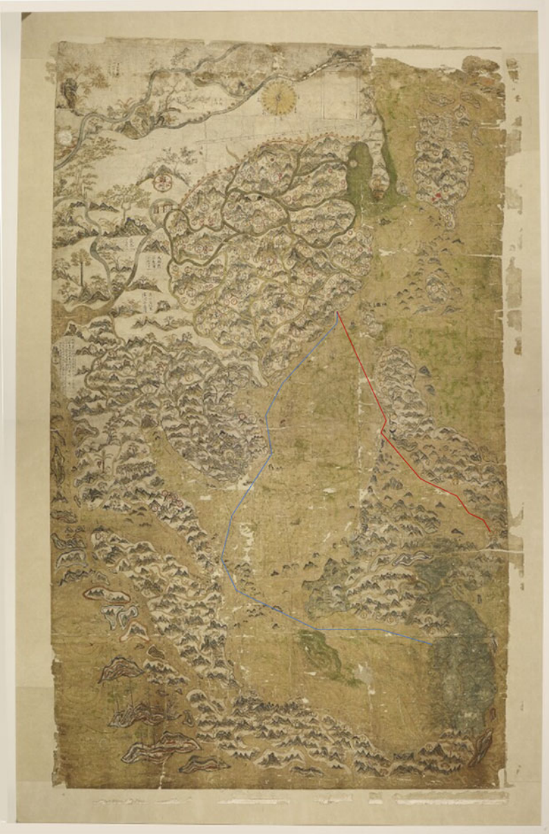
Figure 3. The two navigation routes connecting China and the world of Maluku on the Selden Map.

The critical section in the eastern route to Maluku was from Manila to Ternate. This section is desperately understudied, as it is outside the conventional scope of the Galleon Trade, which focuses almost exclusively on China's connection with the "New World" via Manila while neglecting the role played by the rest of the Philippine Islands.