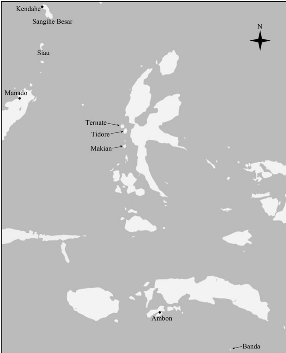
Figure 5. The world of Maluku with place names mentioned in this study.