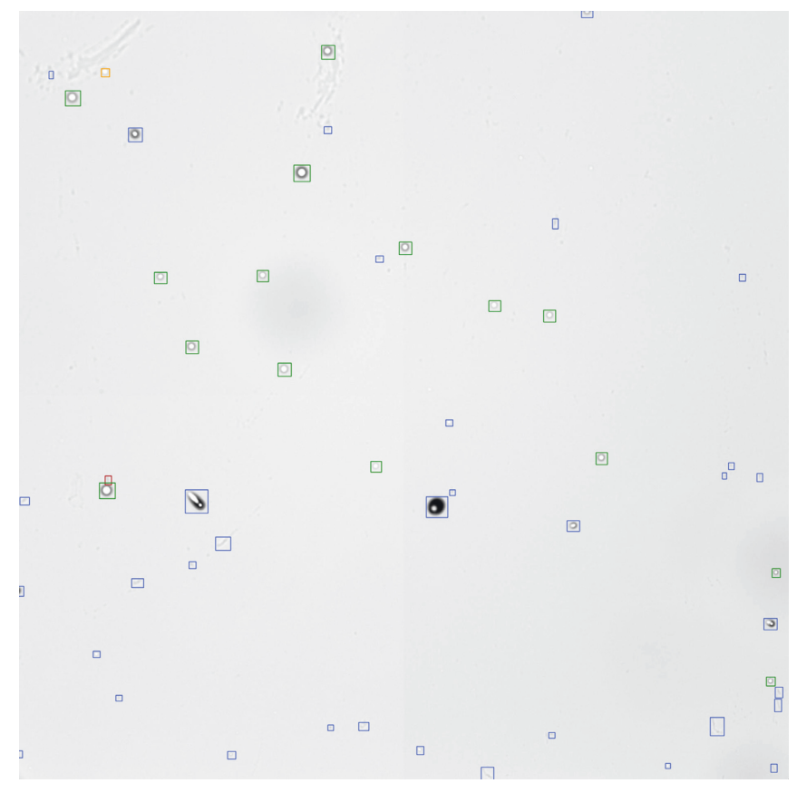
FIGURE 3: An example of FAINE tagging signs inside a CR-39 image. Green squares indicate true positives, blue squares indicate true negatives, red squares indicate false positives, and orange squares indicate false negatives.