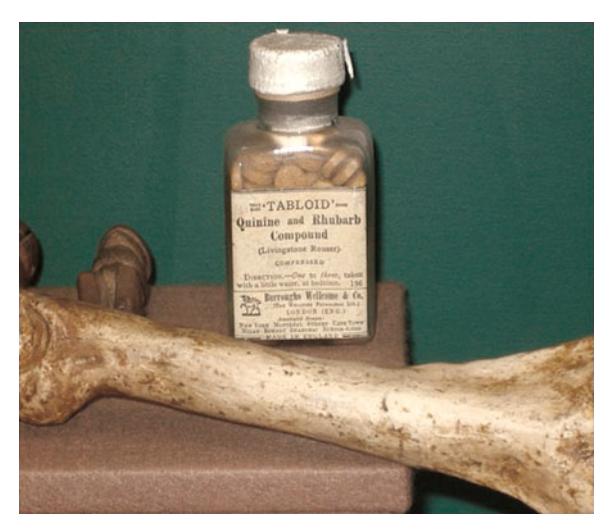
Fig. 2. Livingstone's rousers. The quinine, rhubarb and jalap mixture that Livingstone concocted was later marketed by the Pharmaceutical Company Burroughs Wellcome & Co. This bottle is on display at the David Livingstone Centre in Blantyre. A cast of the bone broken in a lion attack is in the foreground.

edition as the mentor of Sir William Leishman (see article in this special issue by Heather Vincent). Although not the first to use quinine, Livingstone's fame and the reverence in which he was held helped assure systematic use of the drug as Britain extended her colonial rule in the tropics. The drug, still used today, also inspired the production of other drugs, such as chloroquine, a cheap, chemically made quinoline-based alternative. The emergence of resistance to chloroquine has rendered it useless across many parts of the world, but other drugs are available. Many of these are based on a Chinese herbal remedy, artemisinin, of which Livingstone would have approved, given his frequent and diligent experimentation with possible herbal cures for malaria and other diseases. New medicines are also appearing at an impressive rate in efforts led by the Medicines for Malaria Venture (MMV) (Wells et al. 2015), as modern pharmaceutical chemistry is applied to the disease.