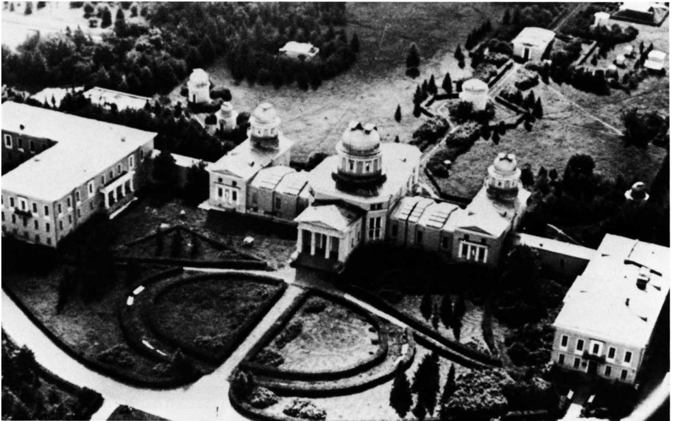
Plate IX. The reconstructed Pulkovo Observatory viewed from the northwest in an aerial view.